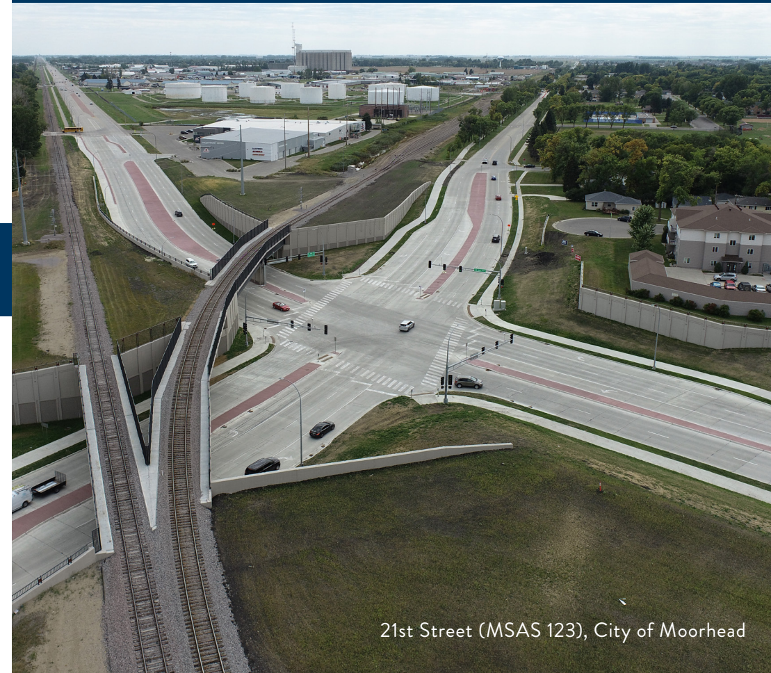
21st Street (MSAS 123), City of Moorhead

Reported bridges are on state trunk highways, county roads, city streets, and township roads, and do not reflect number of bridges owned by each agency type.