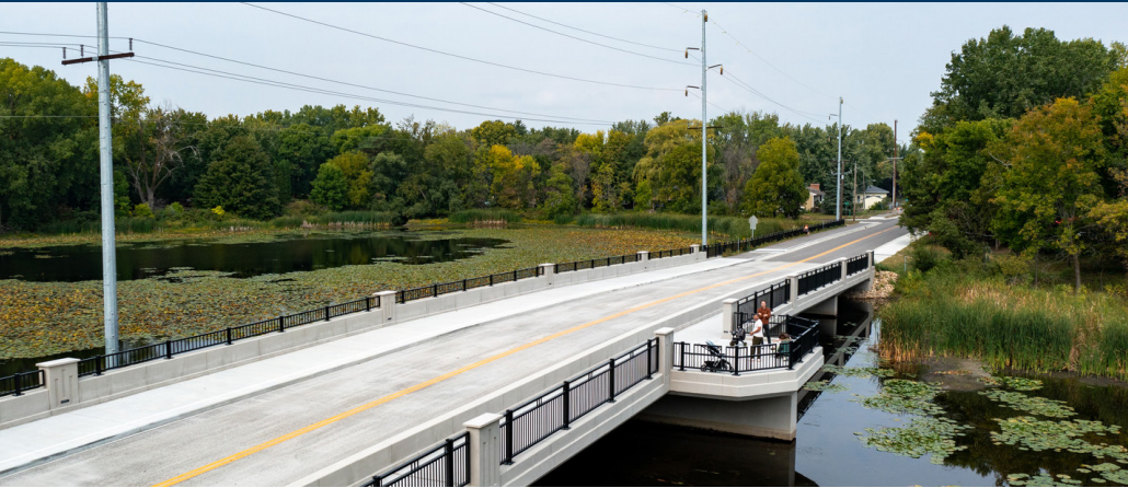
Eden Prairie Bridge (Bridge 27C71), City of Eden Prairie

Minnesota's economic strength and vitality depends on an effective transportation system. To support the state's system of streets, roads and bridges, the Minnesota Department of Transportation distributes funds for highway maintenance and construction to counties, cities and townships based on a formula determined by the legislature.