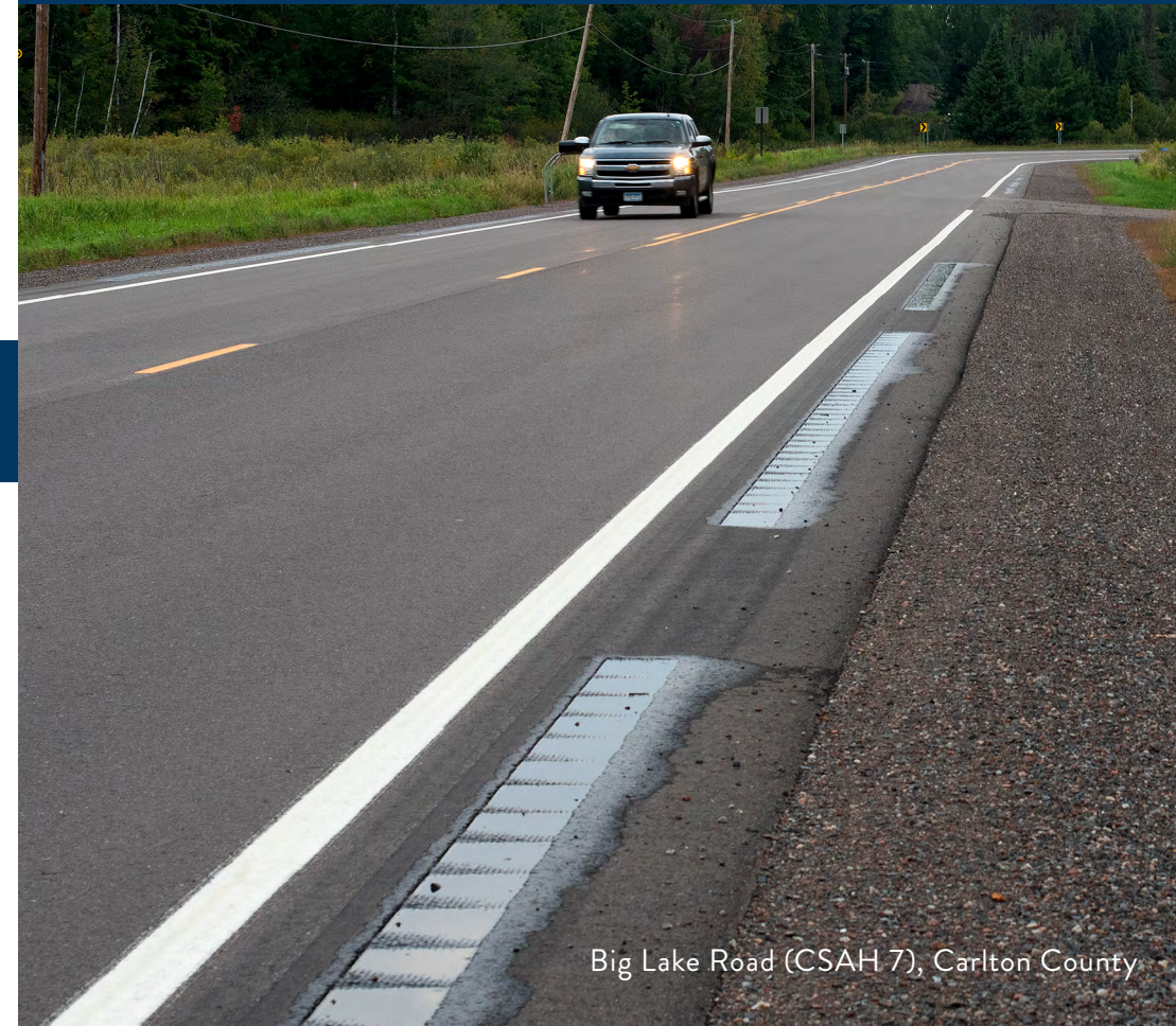
Big Lake Road (CSAH 7), Carlton County

Reported bridges are on state trunk highways, county roads, city streets, and township roads, and do not reflect number of bridges owned by each agency type.