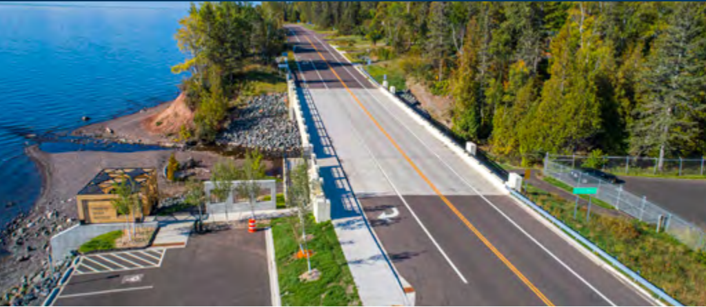
Bridge 69A70, Duluth Township (St. Louis County)

Minnesota's economic strength and vitality depends on an effective transportation system. To support the state's system of streets, roads and bridges, the Minnesota Department of Transportation distributes funds for highway maintenance and construction to counties, cities and townships based on a formula determined by the legislature.