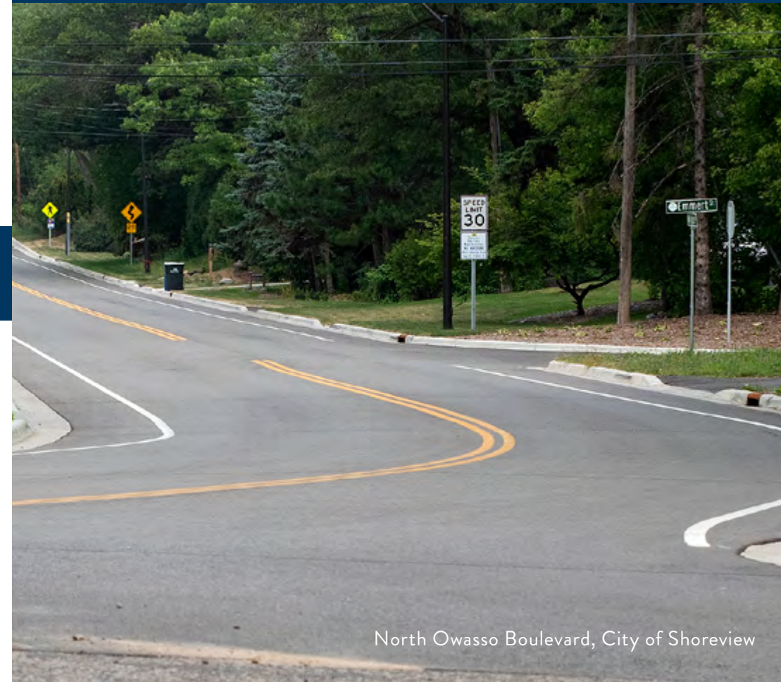
North Owasso Boulevard, City of Shoreview

Reported bridges are on state trunk highways, county roads, city streets, and township roads, and do not reflect number of bridges owned by each agency type.