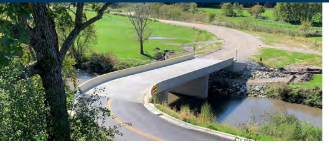
Bridge 23536, Carrolton Township (Fillmore County)

Minnesota's economic strength and vitality depends on an effective transportation system. To support the state's system of streets, roads and bridges, the Minnesota Department of Transportation distributes funds for highway maintenance and construction to counties, cities and townships based on a formula determined by the legislature.