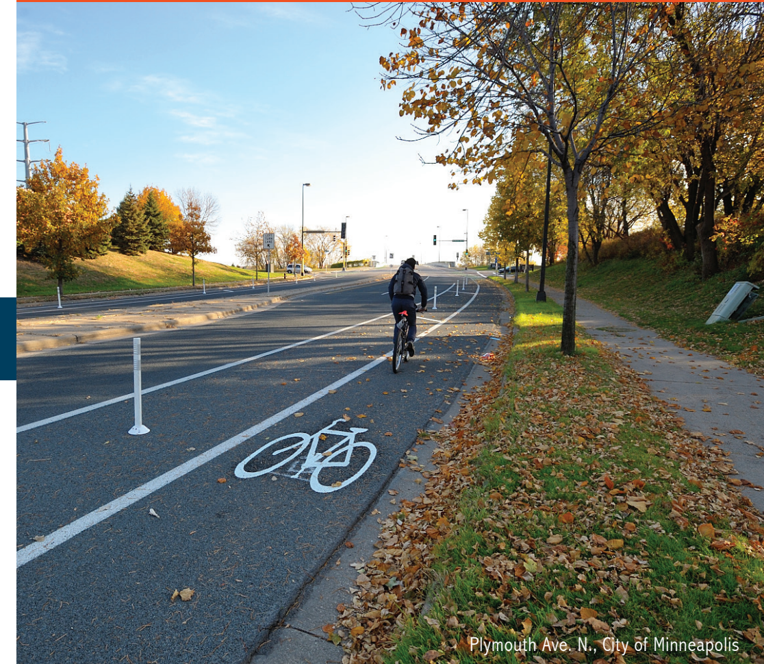
Plymouth Ave. N., City of Minneapolis