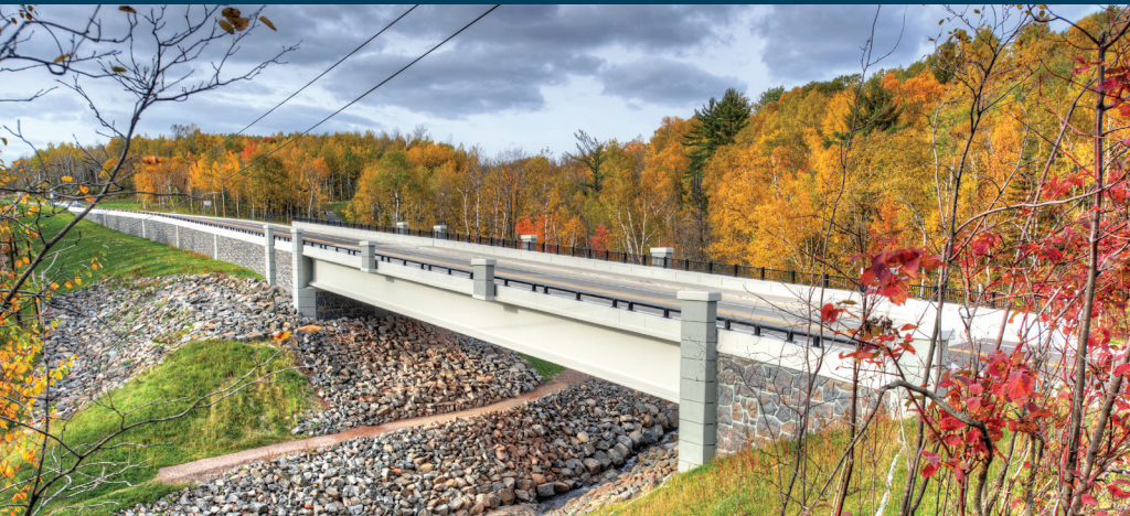
Bridge 69A18, Highland St., City of Duluth

Minnesota's economic strength and vitality depends on an effective transportation system. To support the state's system of streets, roads and bridges, the Minnesota Department of Transportation distributes funds for highway maintenance and construction to counties, cities and townships based on a formula determined by the legislature.