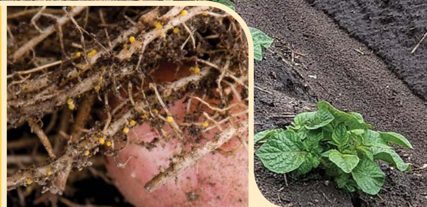
Yellow potato cyst nematode females on a potato root.