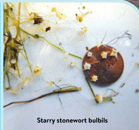
Starry stonewort bulbils