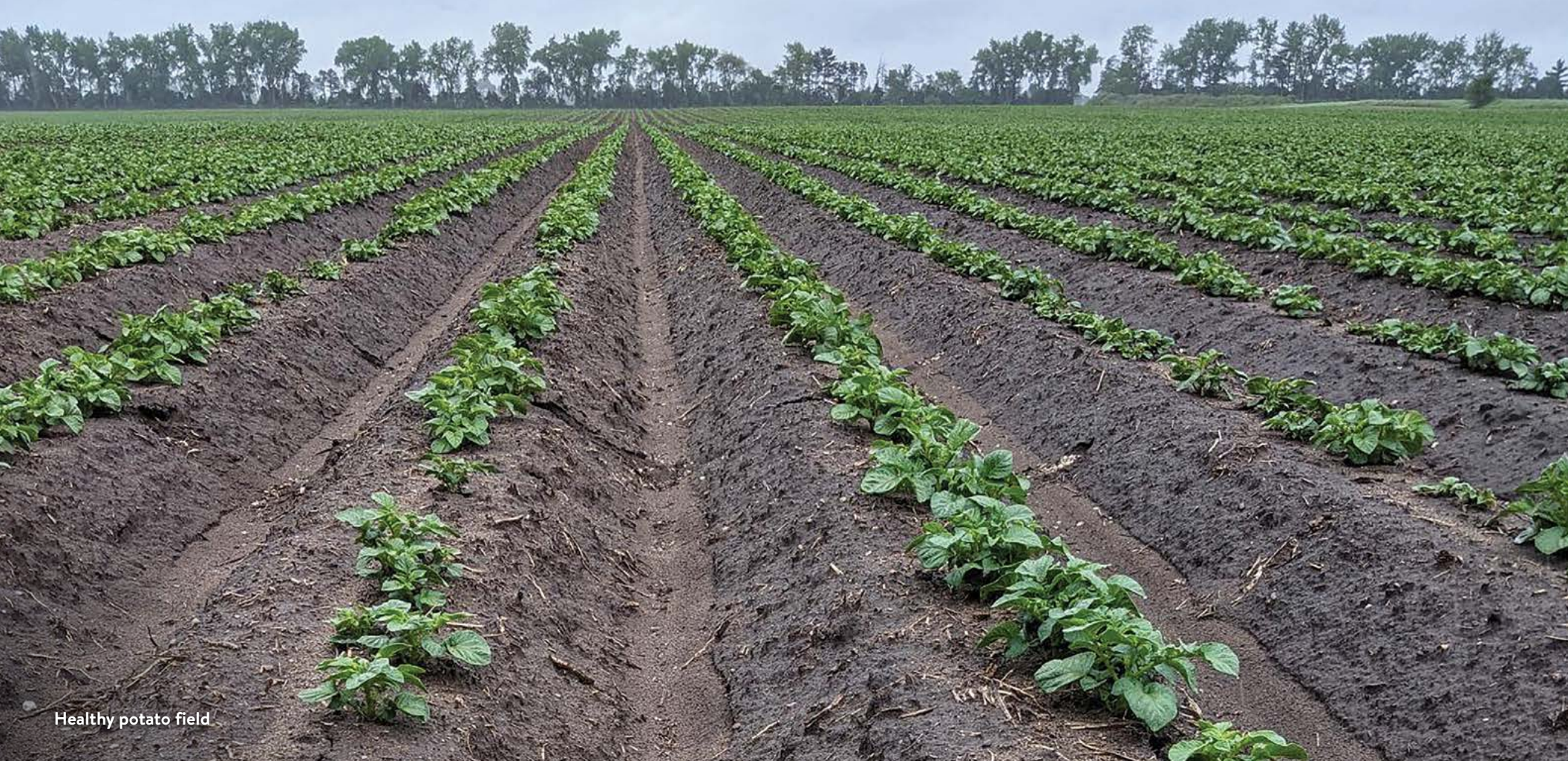
Healthy potato field