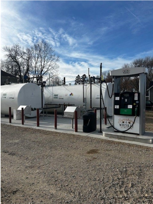
Photo 1. Sunshine and Whiskey Filling Station, located in Watson, now offers their small community access to biofuels at any of their station's four fueling stations.

Sunshine and Whiskey Filling Station in Watson, Minnesota, was the most recent grantee to complete its Biofuels Infrastructure project. This small-town business, managed and operated by Autumn Lee, received a Biofuels Infrastructure Grant of $159,777. The grant was matched with more than $161,000 in private funds. Their project involved replacing four fuel pumps so that customers can pump E15 and E85 at any one of the station's four fuel islands. Previously, no biofuel options were available at this station. The new equipment went into operation in September 2023.