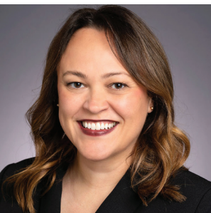
SENATOR ALICE MANN District 50