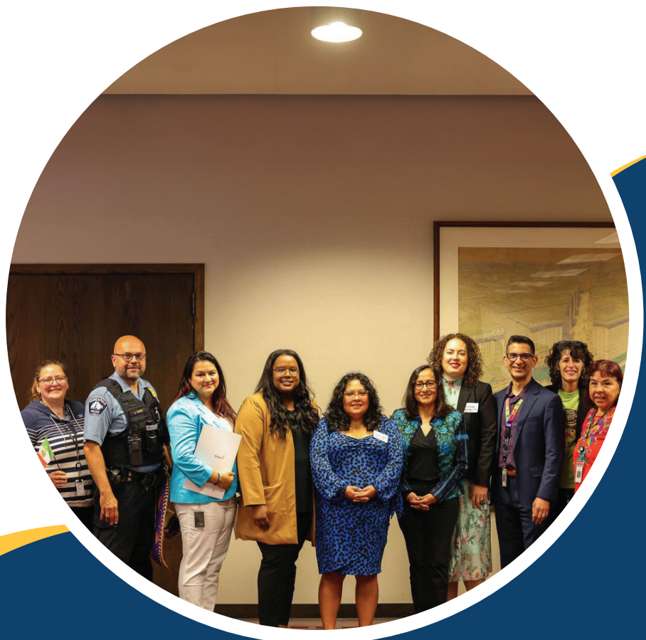
Group of Latino leaders after reading the City of Minneapolis' Latino Heritage Month, including MCLA's staff

Finally, MCLA was recognized by the National Association of Hispanic Realtors-Twin Cities, with the 2023 President's award for our commitment to Latino Homeownership in recognition of past and current staff advocating for ITIN filers' inclusion to take advantage of this benefit.