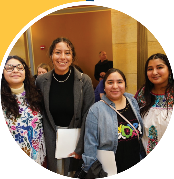
Young attendees at MCLA's Latine Day at the Capitol

adapt and serve as a bridge between the community and state government. Our team advised key government agencies, including the Minnesota Department of Education, the Minnesota Department of Health, the Office of Higher Education, the Department of Labor and Industry, and the Department of Employment and Economic Development. On multiple occasions, we also contributed information to various legislators and state agencies with recommendations gleaned from our outreach to our constituents about different needs.