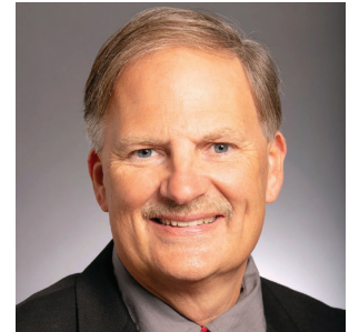
SENATOR GENE DORNINK District 23