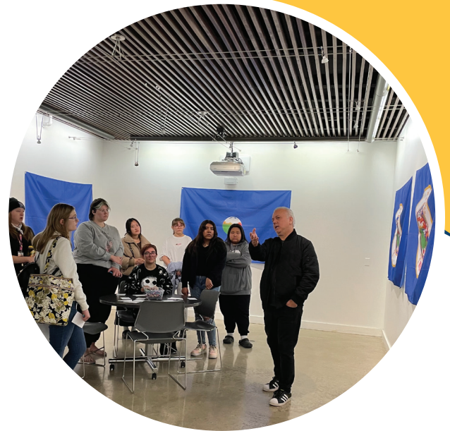
Commissioner and Chair Luis Fitch “deconstructing” the current Minnesota flag with a group of college students

The Council’s staff and members work collaboratively in its internal Legislative Committee, which helps staff strategize and offer recommendations regarding the Council’s overall legislative and policy work. In that vein, MCLA continued to focus on our legislative work, ranging from supporting a comprehensive bill to increase teachers of color with critical investments, raising awareness about the singular work of Latina estheticians by removing barriers in their