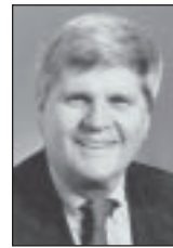
Minority Leader- Designate Dick Day

Prepared by Minnesota Senate Publications 325 Capitol St. Paul, MN 55155 (651) 296-0259