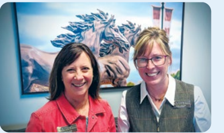
Librarians at the center of student life: Southwest Minnesota State University