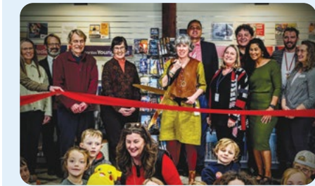
Northfield Public Library Oasis serves patrons where they are

Read about how these and other libraries benefit communities across Minnesota: z.umn.edu/lib-profiles