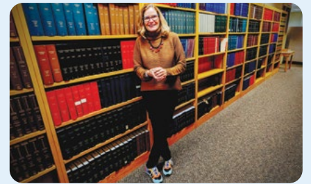
Minnesota Revenue Library supports fair tax system for all