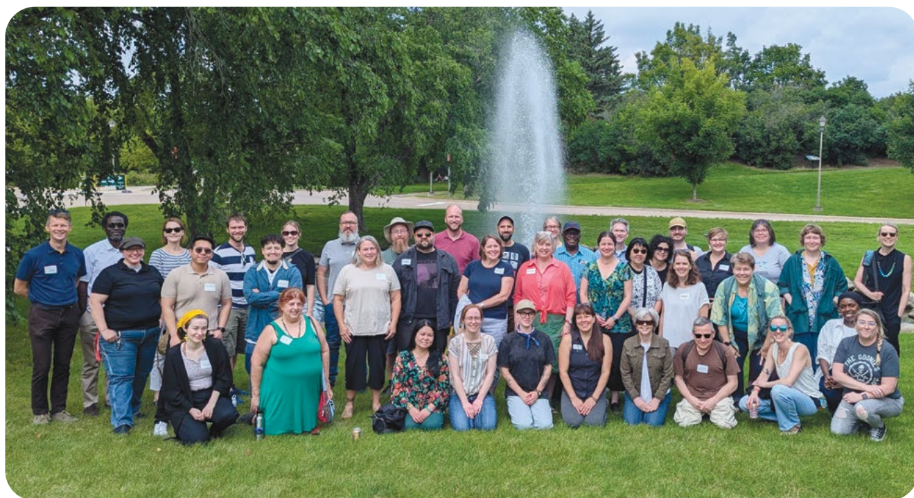
Minitex Staff Day 2024

CONNECTED LIBRARIES. EMPOWERED COMMUNITIES. ENRICHED LIVES.