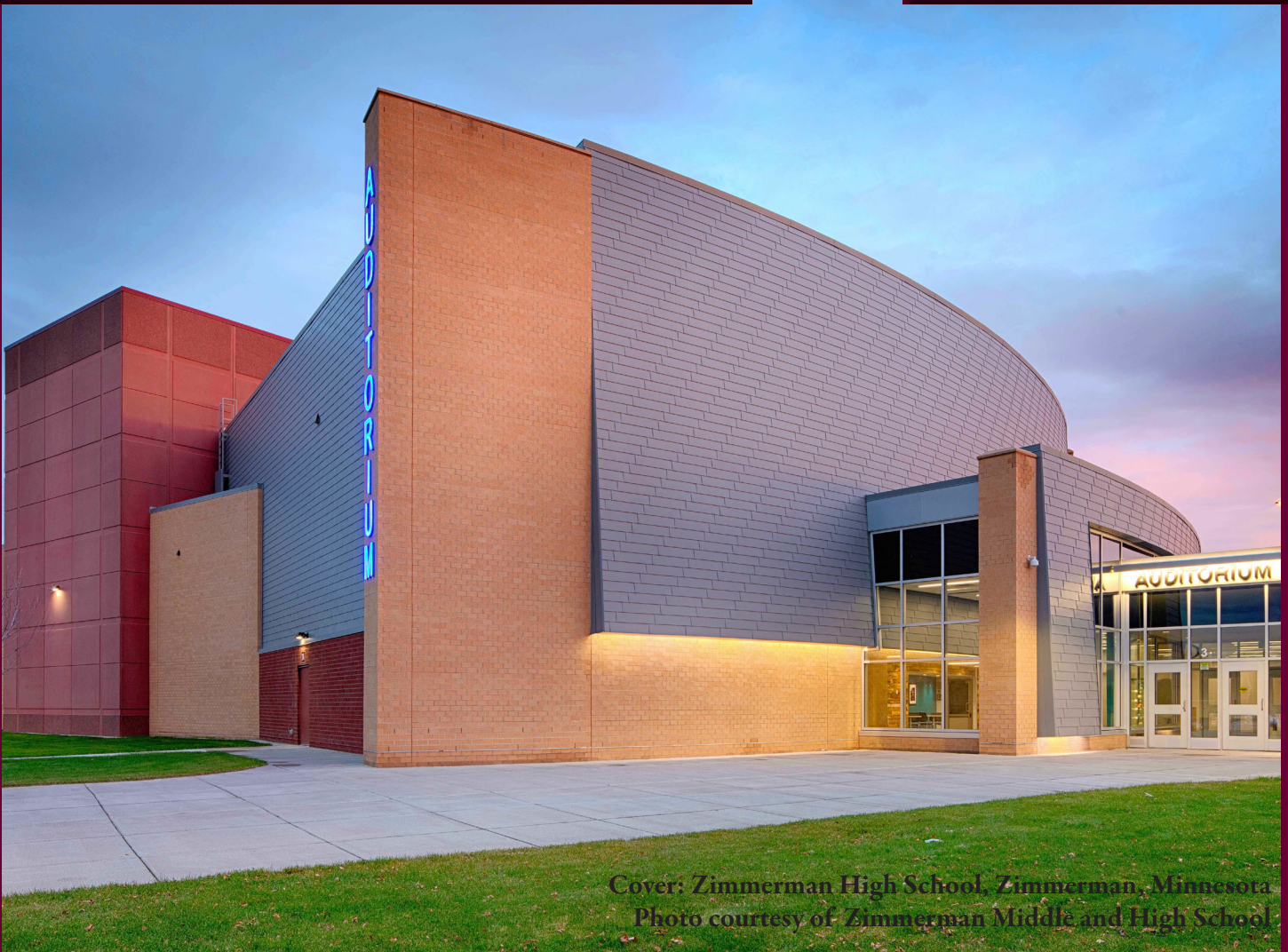
Cover: Zimmerman High School, Zimmerman, Minnesota

A Pension Trust Fund of the State of Minnesota