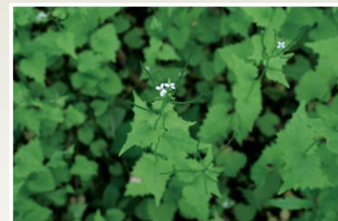
Edible Invasive Species