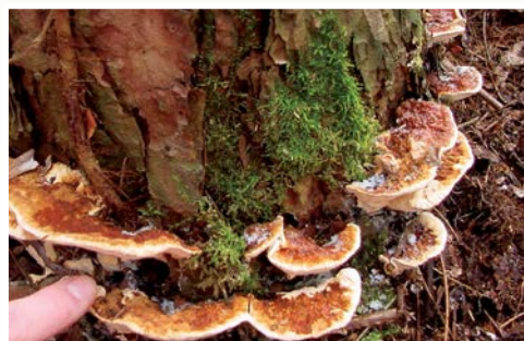
Annosum Root Rot