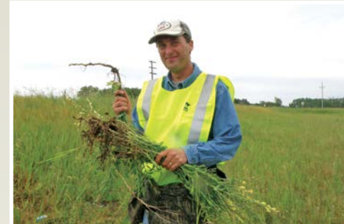
Dalmatian Toadflax Eradication Effort