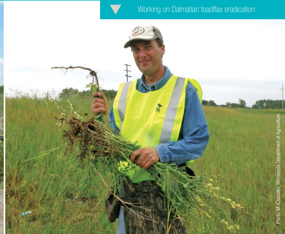
▼ Working on Dalmatian toadflax eradication