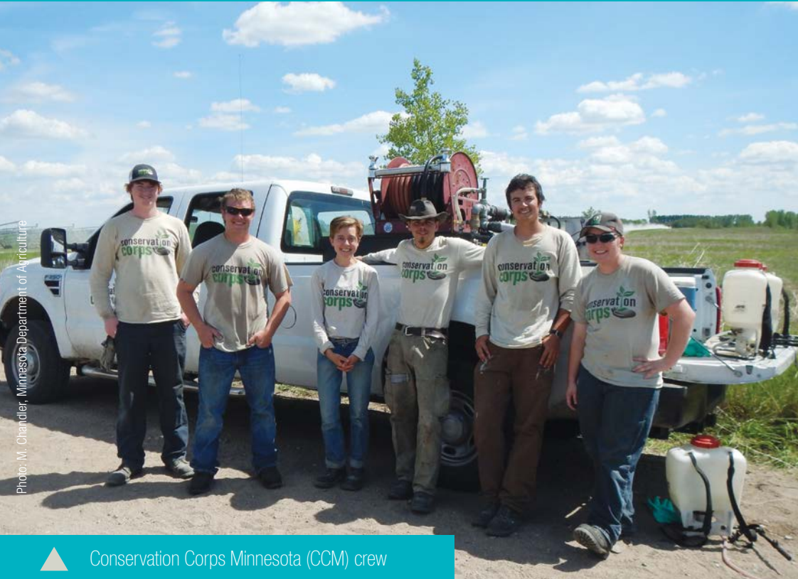
▲ Conservation Corps Minnesota (CCM) crew