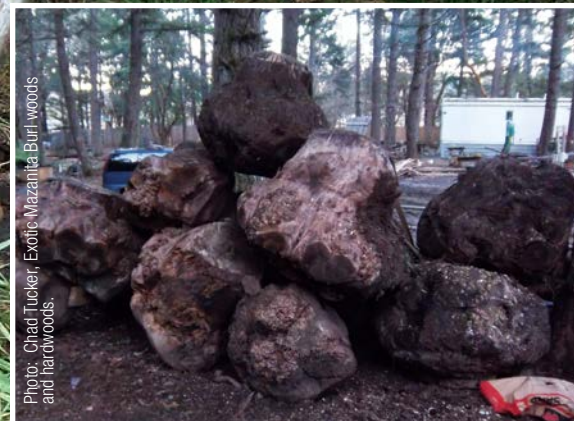
Exotic Mazatlan Burl woods and hardwoods.

Pine logs brought from Montana to Minnesota also could bring in the mountain pine beetle.