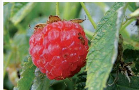
Spotted Wing Drosophila