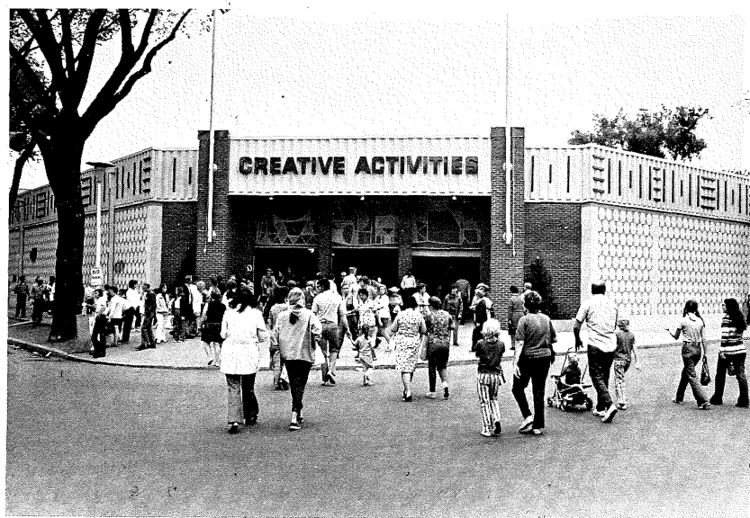
Crowds poured in and out of the new Creative Activities Building throughout the 10-day Fair. A major construction project in 1971, the colorful building is situated on the former site of the Home Activities Building. The Home Activities Department has been renamed the Creative Activities Department to more accurately reflect its diversity.

Monday's attendance was 104,077, a figure which included 43,732 children.