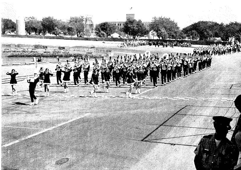
Chatfield High School Marching Band parades past the State Fair Grandstand as three more units wait their turn to perform. Fifteen schools participated in the Fair's first High School Band Day, Friday, Sept. 3, with South St. Paul and Long Prairie taking top honors.

In the Hippodrome, the Western Horse Show continued. Events included