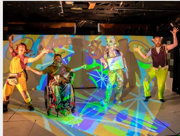
■ OFF-LEASH AREA, Neighborhood Garage Tour | MULTIPLE MINNESOTA LOCATIONS