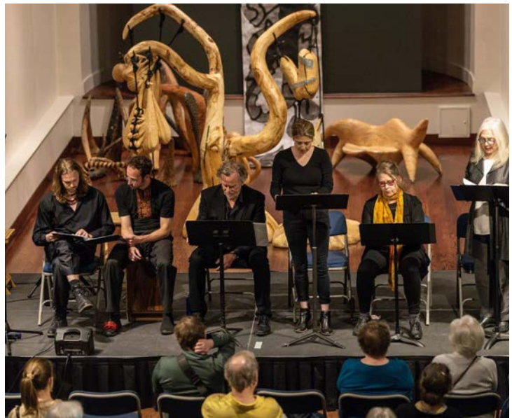
■ THEATER NOVI MOST, Ukrainian Words Project | MINNEAPOLIS