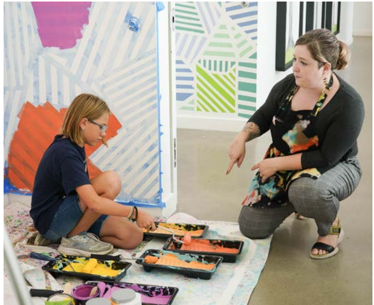
■ ROCHESTER ART CENTER, Total Arts Day Camp | ROCHESTER

A list of the eleven councils, the geographic areas they serve by county, and the amounts of their block grants can be found in the "Fiscal Year 2024 Block Grants to Regional Arts Councils" section of this report (pages 26-27). The section "Regional Arts Councils Fiscal Year 2024 Summary of Requests and Grants" (page 28) presents the number of applications received and grants awarded, as well as the total dollars requested and granted by the regional arts councils in fiscal year 2024.