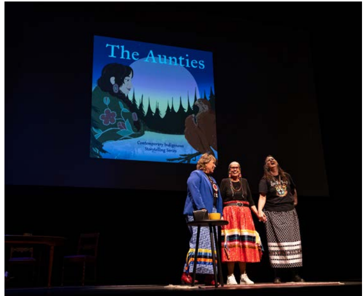
■ THE O'SHAUGHNESSY, The Aunties | SAINT PAUL