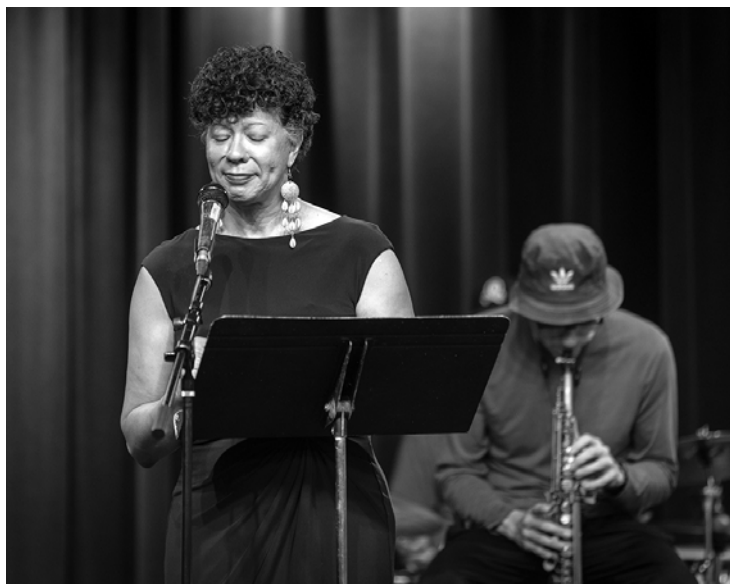
■ SAINT PAUL ALMANAC, Listen! An Evening of Poetry and Music | SAINT PAUL