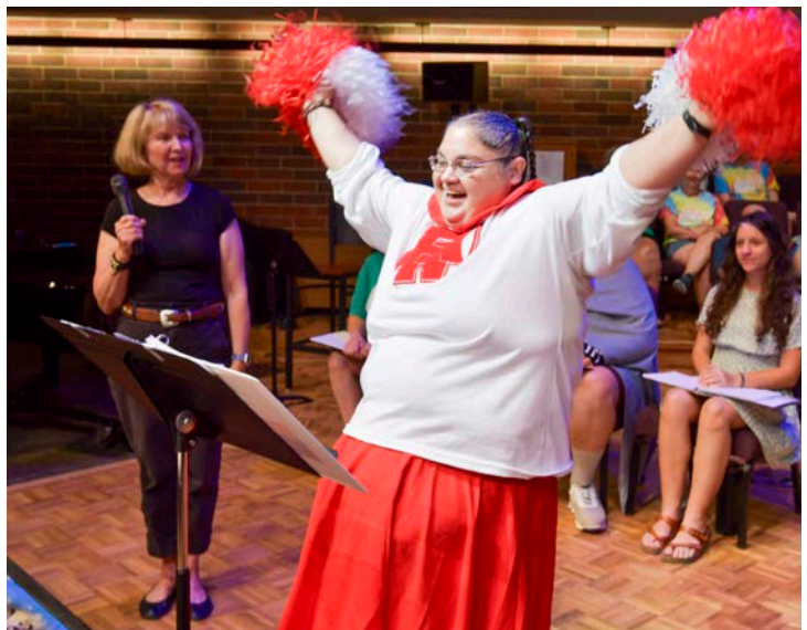
■ OPEN ARTS MINNESOTA, The Welcoming Table | MANKATO