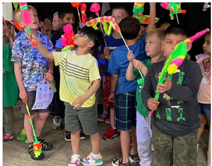
■ Z PUPPETS ROSENSCHNOZ, The Secret Life of Puppets | MINNEAPOLIS