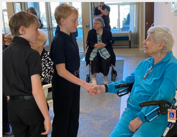
■ MINNESOTA BOYCHOIR, Senior Residence | SAINT PAUL