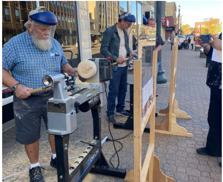
■ PARAMOUNT CENTER FOR THE ARTS , Wood Turning Demonstration | SAINT CLOUD