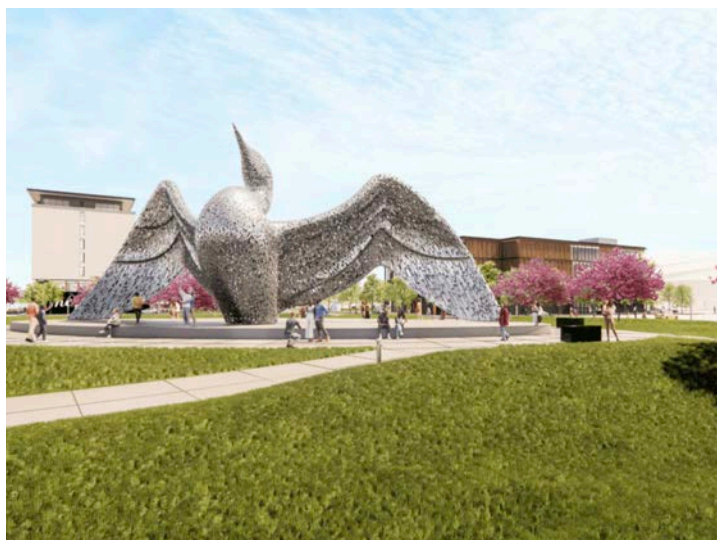
■ ARTIST RENDERING OF PLANNED SCULPTURE | SAINT PAUL

Minnesota United Foundation began work on the project during fiscal year 2024; that work was ongoing as of June 30, 2024.