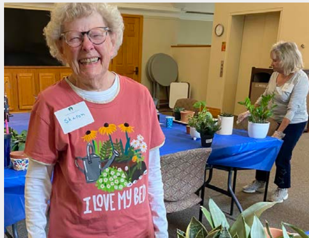
■ MARINE MILLS FOLK SCHOOL, Create, Connect, Age Well | MARINE ON SAINT CROIX