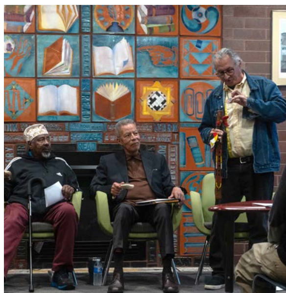
■ MORE THAN A SINGLE STORY, Grandfather Panel | SAINT PAUL