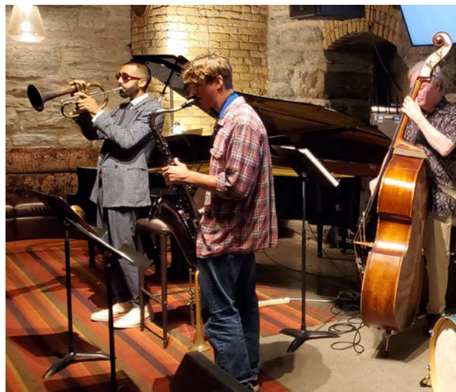
■ MINNESOTA HARD BOP COLLECTIVE, Monday Night Jazz Student Sit-in Series | SAINT PAUL