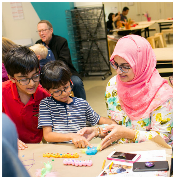
■ MIA, Family Day | MINNEAPOLIS