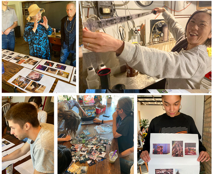
■ BLUE SKY PHOTO WORKSHOP, Participants | MINNEAPOLIS