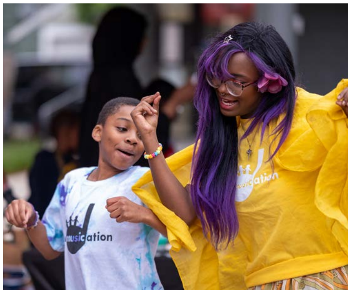
■ COMMUNICATION, Choir Participants | SAINT PAUL