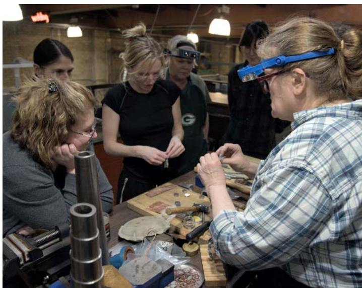
■ CHICAGO AVENUE FIRE ARTS CENTER, Jewelry Workshop | MINNEAPOLIS