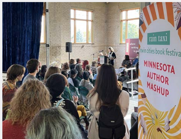
■ TWIN CITIES BOOK FESTIVAL | FALCON HEIGHTS