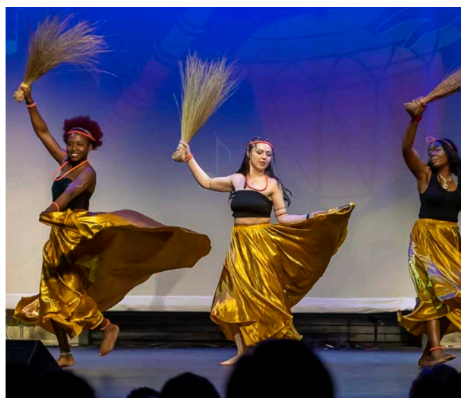
■ CAPRI THEATER, Emume | MINNEAPOLIS