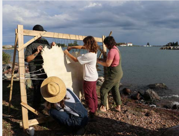
■ NORTH HOUSE FOLK SCHOOL, Tanning Deer Skins | GRAND MARAIS