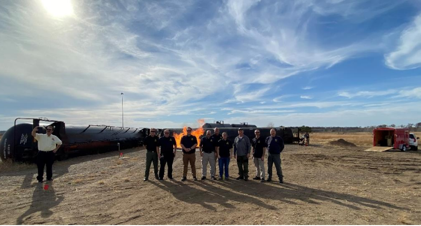
Joint Emergency Response Training Facility-Camp Ripley MN

The JERTC conducted its first training session in Spring 2023, with an attendance of 49 first responders with a total of 102 attending after additional session.