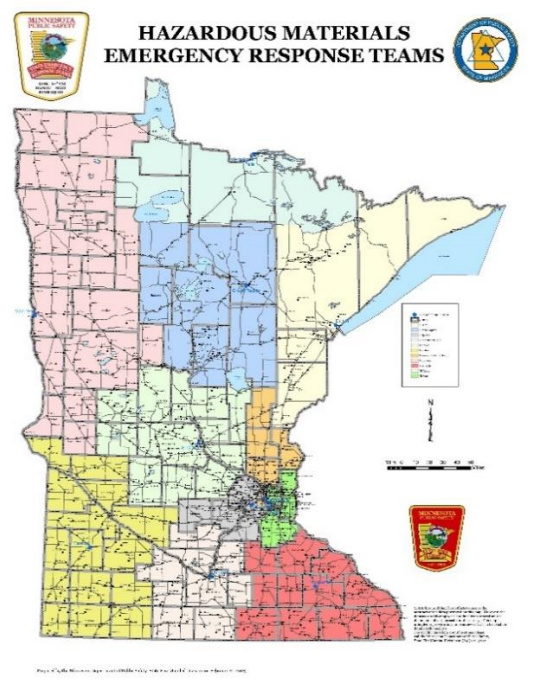
Figure 5: Map of Hazardous Materials Response Teams

SFM manages and oversees the hazardous materials response teams falls under Minnesota Rule 7514 which consists of 11 teams to assist local authorities by providing technical guidance to incident commanders and recommending mitigation measures to protect life, property, and the environment. The 11 HMRT's are strategically located throughout the state to provide timely response to incidents in their assigned area. Each HMRT has staffing and equipment to support identified risks within their assigned area.