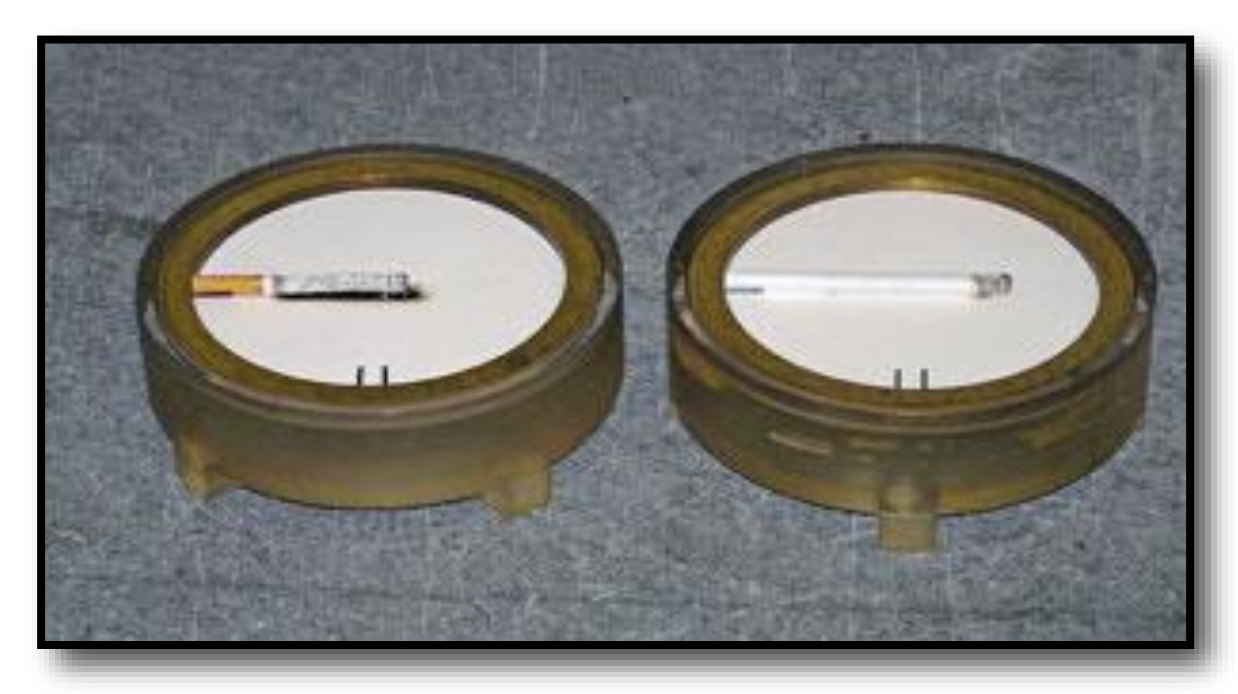
Note: The photo above is provided for illustration purposes only. It is not intended to represent the complete application of the ASTM Standard E2187-04 testing process as it would be performed in a laboratory.

ASTM Standard E2187-04 is the national standard against which all FSC cigarettes are tested to determine the potential for a burning cigarette to ignite materials such as a mattress (without bedding), couch or stuffed chair.