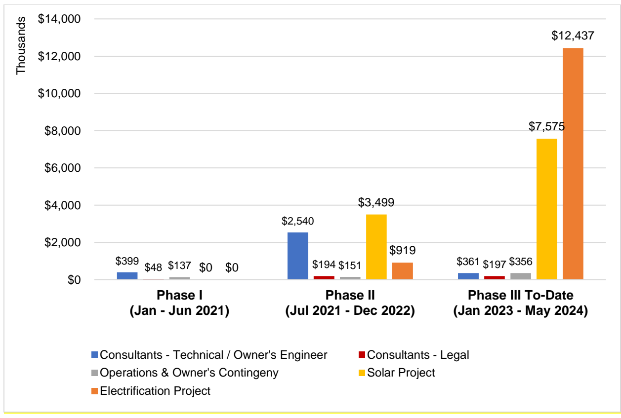
Figure 2. PIIC Expended Funds To-Date

PIIC continues to monitor its use of allocated funds through proactive PIIC-led project management, monthly review of funds expended, forecasting of future Project costs, and negotiation with consultants and contractors to optimize prices.