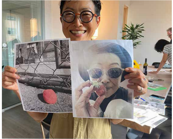
■ BLUESKY PHOTO WORKSHOP | MINNEAPOLIS