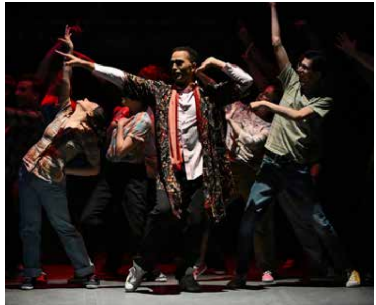
■ DULUTH PLAYHOUSE, Kinky Boots | DULUTH