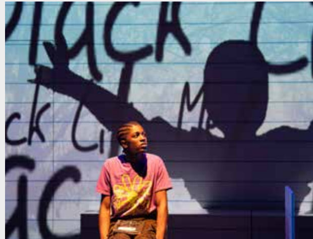
■ CHILDREN'S THEATRE COMPANY, Locomotion | MINNEAPOLIS