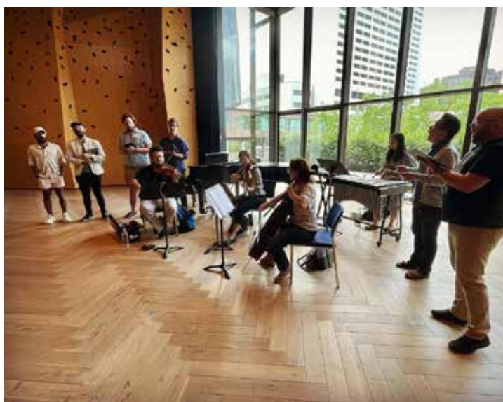
■ CANTUS, Choral Rehearsal | SAINT PAUL