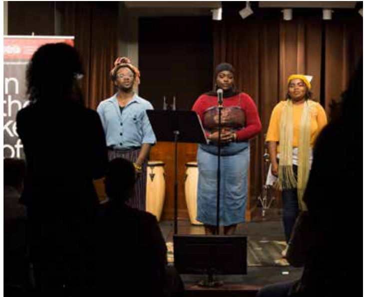
■ AMERICAN COMPOSERS FORUM, Artist Equity Summit | SAINT PAUL

Grant making continues to be the Arts Board's primary activity. In fiscal year 2023, the Arts Board offered three competitive grant programs. It maintained its existing Operating Support grant program and offered its two COVID relief programs—Creative Support for Individuals and Creative Support for Organizations—for a third year. During fiscal year 2023, the Arts Board experienced unprecedented demand for its financial support; it received and reviewed more than 1,400 grant applications and awarded 864 grants totaling $29,364,168.