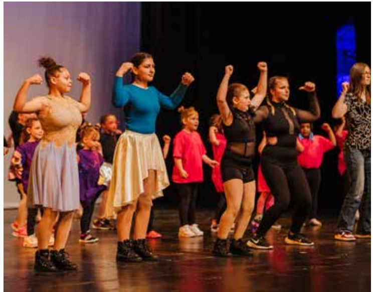
■ BOYS AND GIRLS CLUB OF CENTRAL MINNESOTA, Unstoppable | SAINT CLOUD