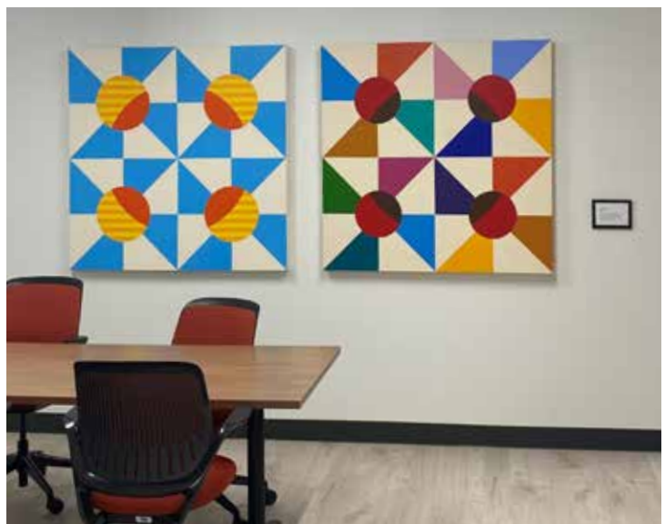
■ GREG INMAN, I-XII Series | MINNESOTA DEPARTMENT OF EMPLOYMENT AND ECONOMIC DEVELOPMENT