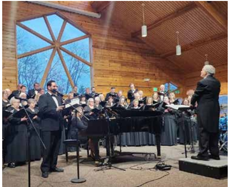
■ LEGACY CHORALE OF GREATER MINNESOTA, 100 Years of Broadway | BRAINERD

Minnesota’s art in state buildings statute allows that up to one percent of the total budget appropriated for construction of new or renovated state buildings may be used to purchase or commission works of art. The Percent for Art in Public Places program enacts the legislation established by the Minnesota Legislature in 1984. It operates under the auspices of the Minnesota Department of Administration and is managed by the Minnesota State Arts Board. During fiscal year 2023, the program administrator: conducted condition assessments on many pieces of art in the state’s collection; worked to relocate Greg Inman I-XII Series , which had been installed at Minnesota State College Southeast Technical-Winona, to the Minnesota Department of Employment and Economic