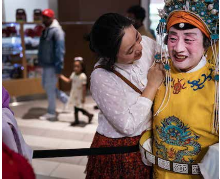
■ ALLIANCE OF MINNESOTA CHINESE ORGANIZATIONS, Lunar New Year Event | SAINT PAUL