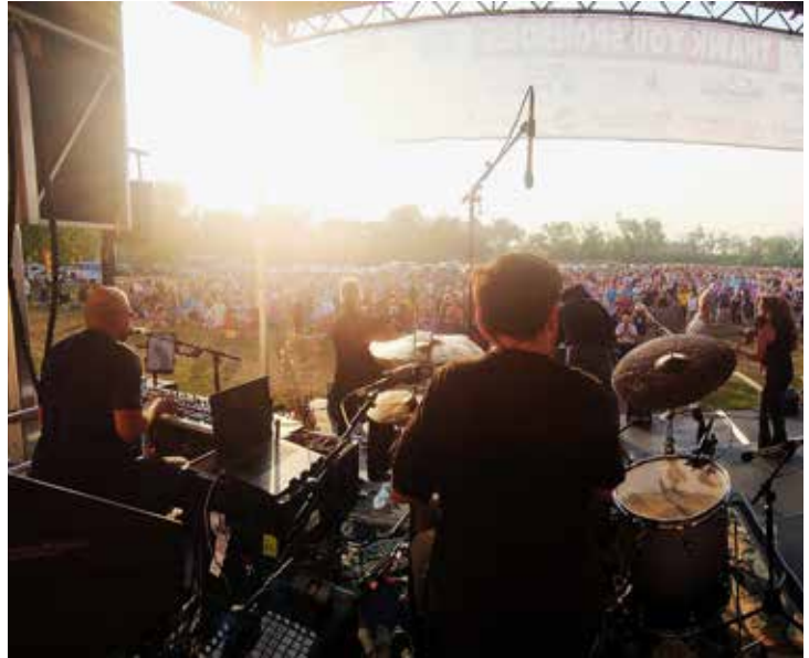
■ A CENTER FOR THE ARTS, Downtown Concert Series | FERGUS FALLS