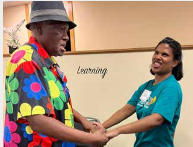
■ WINGSPAN LIFE RESOURCES , Exploring Self-Identity through Dance | SAINT PAUL