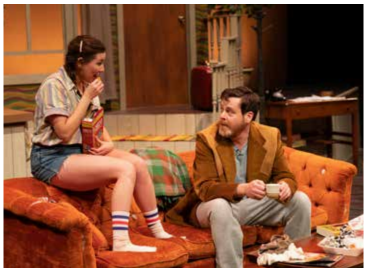
■ COMMONWEAL THEATRE COMPANY, I Ought to Be in Pictures | LANESBORO