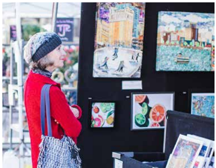
■ RED WING ARTS FESTIVAL | RED WING