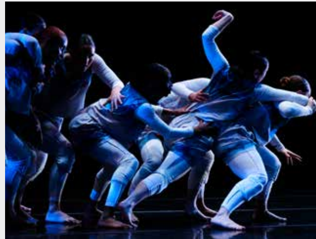
■ TU DANCE, The 3-Women Project | SAINT PAUL