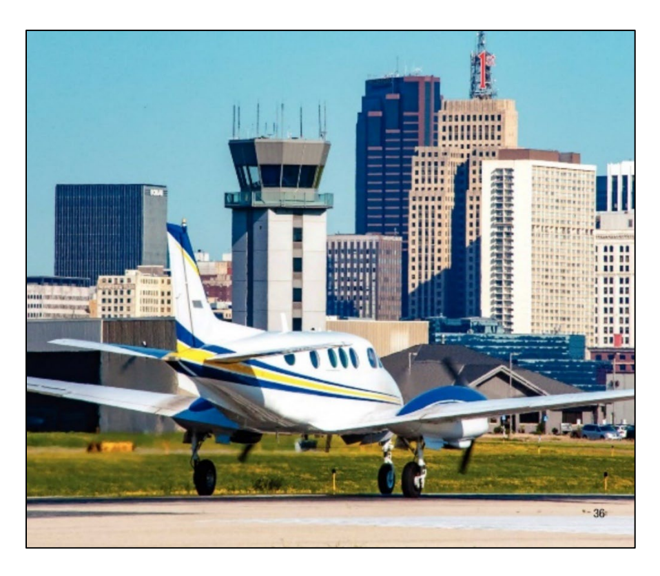
St. Paul Downtown Airport

None of the proposed projects listed in the preliminary 2023-2029 CIP meet the threshold in Minnesota Statutes Section 473.614 for an EAW. Although some of the STP projects may have temporary impacts during construction, the MAC will use mitigation measures during construction to minimize potential adverse effects such as noise, dust, and erosion. The environmental effects of construction are temporary, will be minimized using conventional mitigation measures and best management practices, and do not constitute long-term cumulative potential effects when combined with other projects at STP.