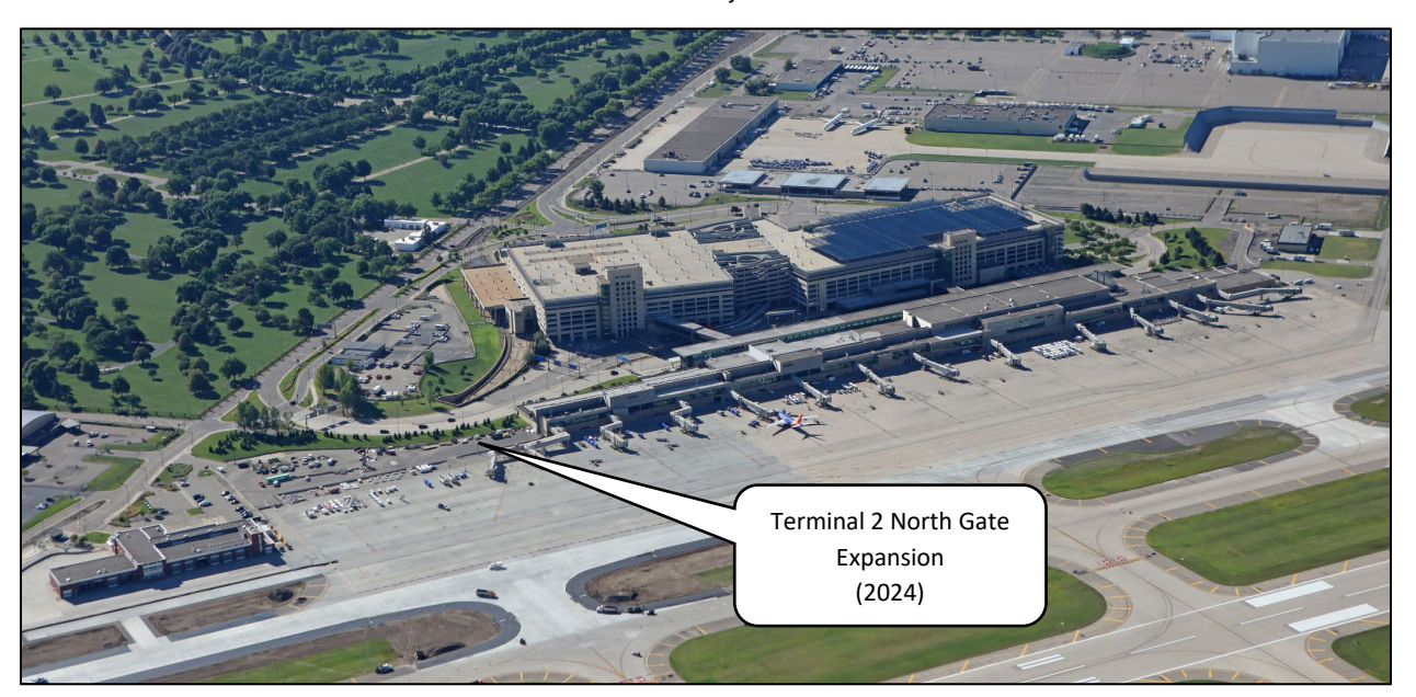
Location for Terminal 2 Project listed in Table 2-1