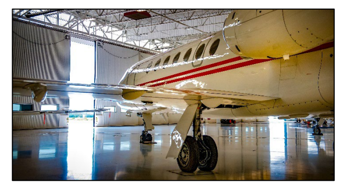
Corporate Hangar at Anoka County-Blaine Airport

Although some of the projects at ANE may have temporary impacts during construction, the MAC will use mitigation measures during construction to minimize potential adverse effects such as noise, dust, and erosion. The environmental effects of construction are temporary, will be minimized using conventional mitigation measures and best management practices, and do not constitute long-term cumulative potential effects when combined with other projects at ANE.