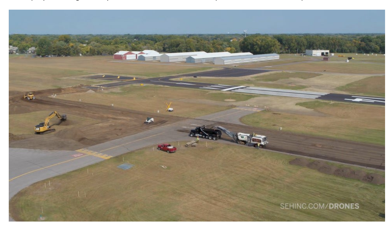
Photo of the Crystal Airport Runway 14R-32L and Taxiway E Modifications project construction.

In October 2017, the MAC adopted the 2035 Crystal Airport Long-Term Comprehensive Plan (LTCP). The proposed project included converting a portion of existing blast pad pavement on each end of Runway 14L-32R to usable runway length, bringing the total length from 3,267 feet to 3,750 feet, as noted above. The parallel Runway 14R-32L has been decommissioned and was reconstructed as a taxiway. All associated electrical runway and taxiway lighting work was included along with taxiway reconfiguration to simplify airfield geometry. All construction on these improvements is now complete.