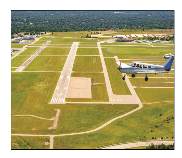
Flying Cloud Airport

Although some of the projects in the outer years at FCM may have temporary impacts during construction, the MAC will use mitigation measures during construction to minimize potential adverse effects such as noise, dust, and erosion. The environmental effects of construction are temporary, will be minimized using conventional mitigation measures and best management practices, and do not constitute long-term cumulative potential effects when combined with other projects at FCM.