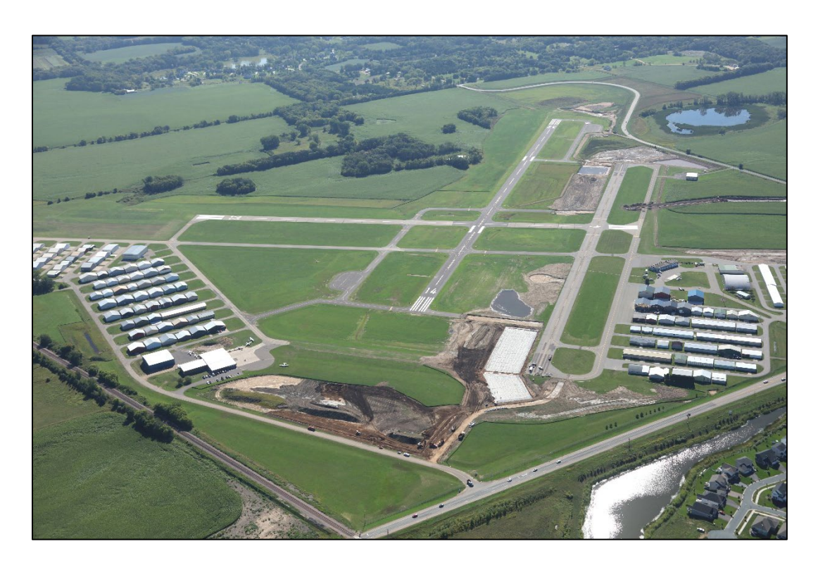
Runway 14-32 Relocation/Extension and Associated Improvements construction site.

The proposed project, currently in its final phase of construction, includes construction of a new 3,500-foot primary runway that will be parallel to the existing Runway 14-32. Now that the new runway is complete, the existing runway will be decommissioned and become a parallel taxiway (this project is already bid and the majority of construction will occur in 2023). Other airfield modifications will be made for connection to the new runway, along with an extension of crosswind Runway 4-22 to 2,750 feet. Realignment of 30<sup>th</sup> Street North was also completed as part of the project.