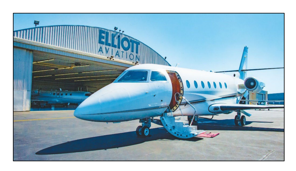
Flying Cloud Airport

MAC is currently preparing a 2040 long-term plan for Flying Cloud. MAC has held one public information meeting and planning another in late October 2022. The long-term plan update is scheduled for completion in 2023.