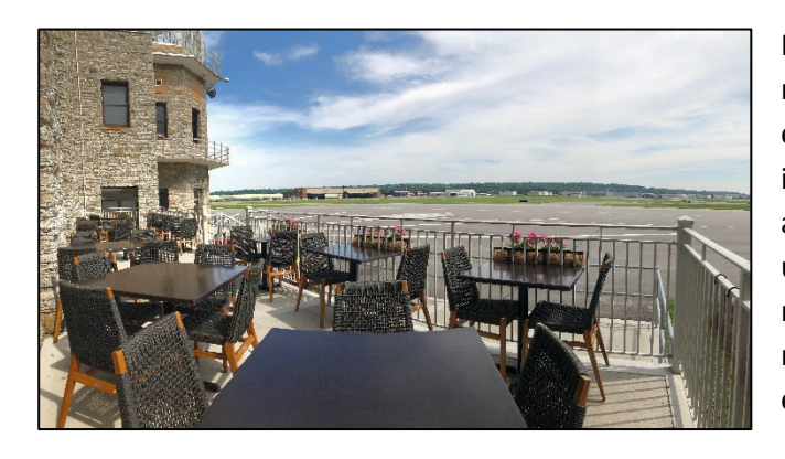
St. Paul Downtown Airport

On September 26, 2022, the MAC Commission adopted the Preliminary 2023–2029 CIP (shown in Appendix A). This AOEE report is prepared in accordance with the requirements of Minnesota Statutes Section 473.614, as amended in 1988 and 1996. It presents an assessment of the potential environmental effects of projects in the MAC preliminary seven-year CIP from 2023 to 2029 for each MAC-owned airport. Under Minnesota law, the MAC is required to "examine the cumulative environmental effects at each airport of projects at that airport (in the seven-year CIP), considered collectively."