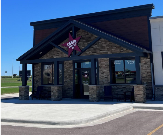
Cabin Coffee in Jackson

Currently, the SRDC has three separate loan funds available to help with your business, including two revolving loan funds and our Property Assessed Clean Energy or PACE program.