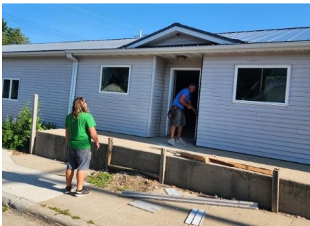
Renovation improvements on the current 3rd street entrance.