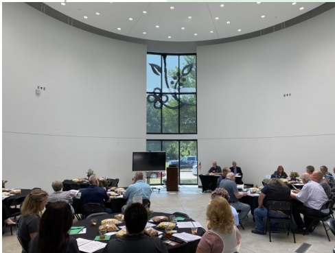
At Cansayapi Wicoicage Oti, the Lower Sioux Indian Community Cultural Incubator

The Southwest Regional Development Commission celebrated its 50th Anniversary at the Annual Meeting at the Lower Sioux Indian Community on July 13, 2023.