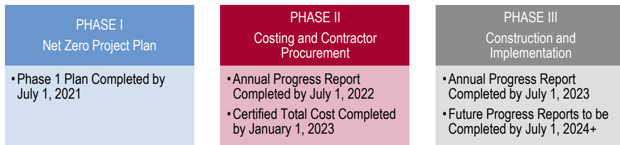
Figure 1. Prairie Island Net Zero Project – Three Phases