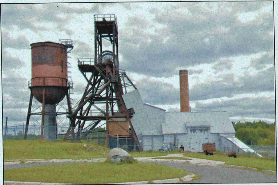
Pioneer Mine Headframe – Ely, MN