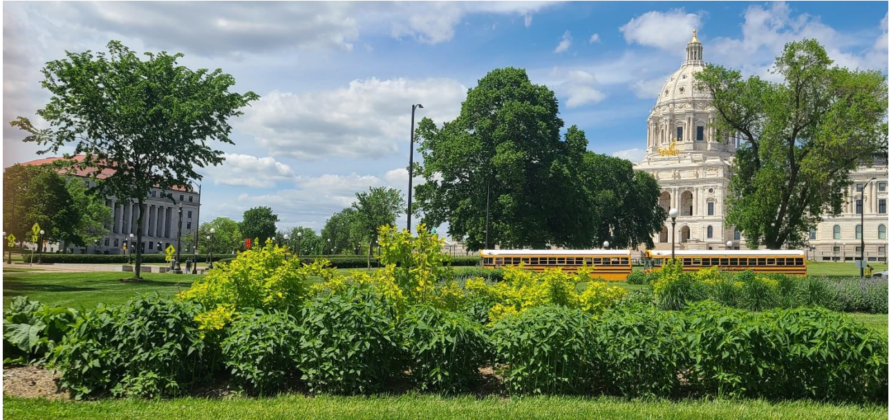
Photo showing plantings at the Women's Suffrage Memorial in foreground and State Capitol building and State Office Building in the background.