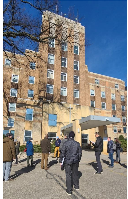
Photo of CAAPB representatives meeting with Fairview-Acadia design team to consider new mental health facility for the Bethesda site.