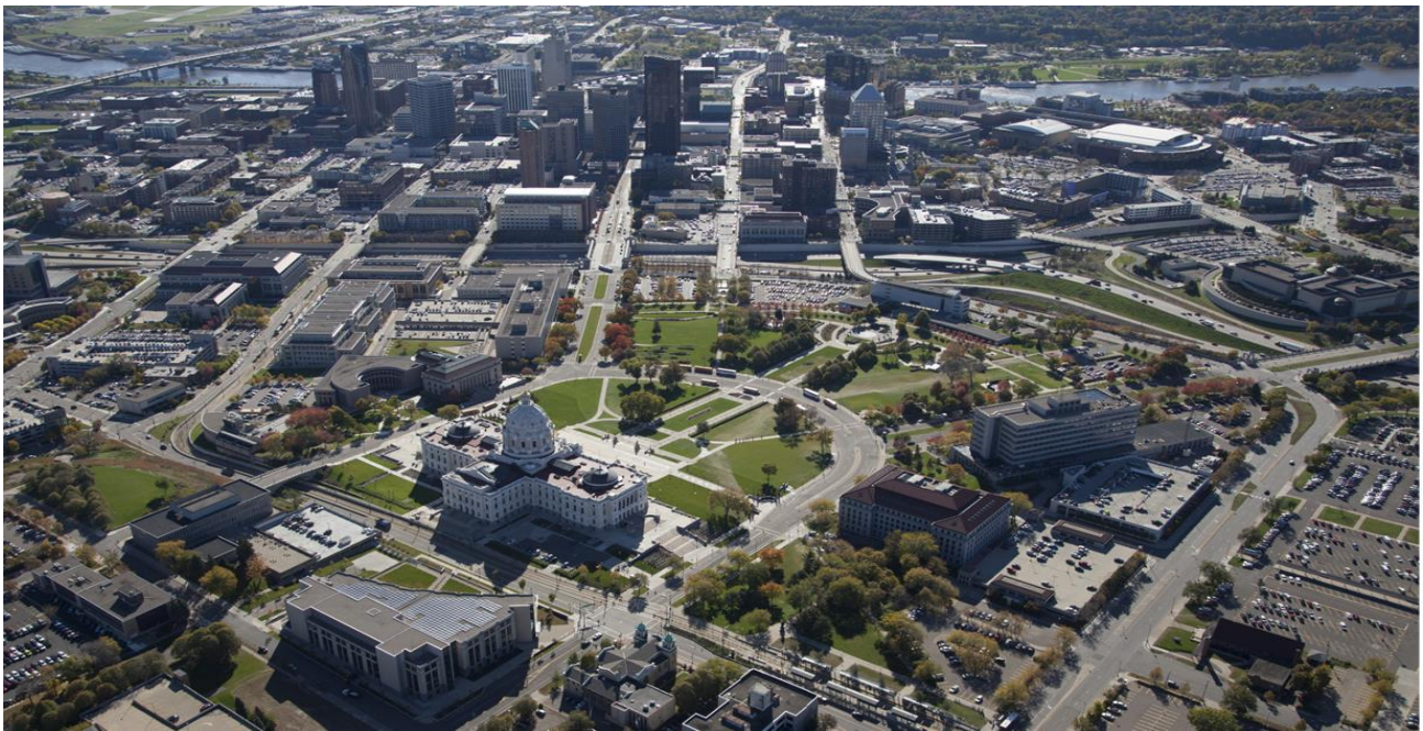
Aerial photo of the Minnesota Capitol campus looking south toward the Mississippi River, showing primary connections of Saint Peter Street, Wabasha Street, and Cedar Street.

- Principle 2 of the 2040 Comprehensive Plan for the Minnesota State Capitol Area, adopted June 2021