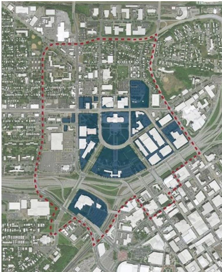
Map showing Capitol Area geography of 60 city blocks centered on the Capitol, as shown by the red dashed line in the map above. It includes governmental (shown as blue on the map), residential, commercial, office, medical, and other land uses.

The Capitol Area Architectural and Planning Commission was created in 1967 to restore a higher standard of quality to the Capitol Area (comprised of 60 blocks surrounding the Capitol Building), after buildings deemed architecturally inappropriate to the Capitol Area were built in the 1950's and 1960's. In 1974, the Legislature changed the Commission to a Board, and designated it as the zoning authority for the 60 block Capitol Area, instead of the City of Saint Paul. The Legislature intended that the Board be comprised of gubernatorial, mayoral, and legislative appointees; and that the Board report directly to the Legislature, unfiltered by any party, special interest group or person, and thus remain protected from political influences.