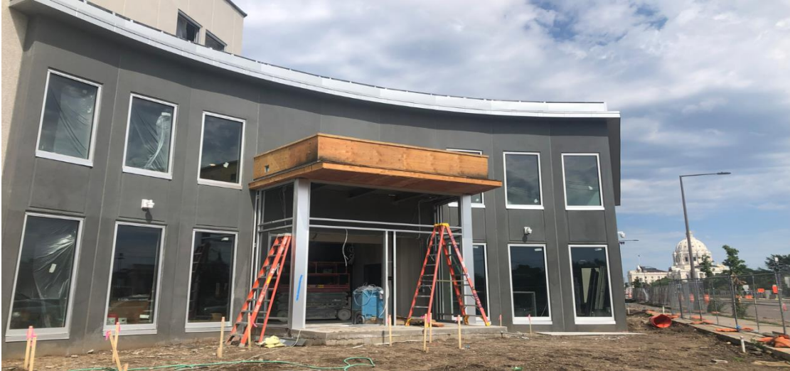
Photo of St. Paul City School under construction along University Avenue. CAAPB worked closely with school leadership and architects on planning, design, and approval.