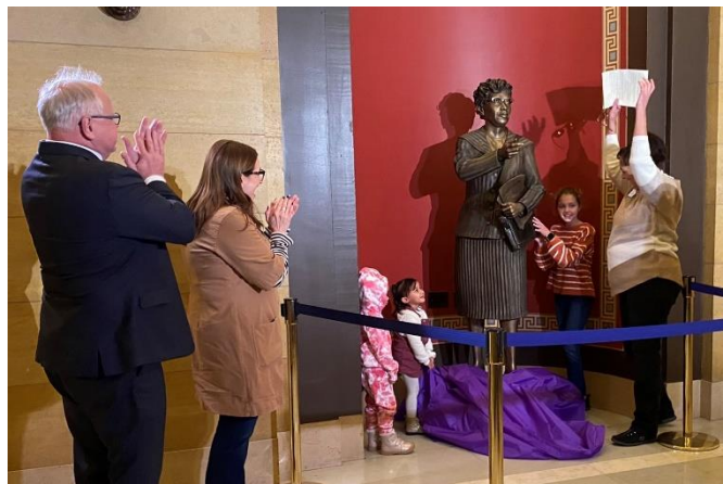
Photo of unveiling celebration for Nellie Stone Johnson statue in the Minnesota State Capitol on November 21, 2022.