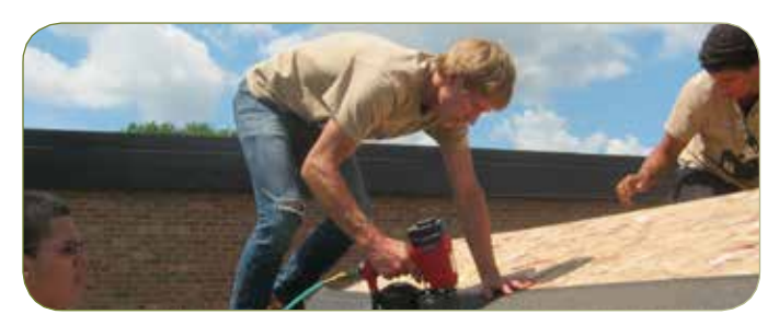
Roofing a shed for Habitat for Humanity.