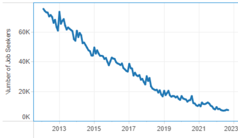
Job Seekers Logging on to MinnesotaWorks.net

Other items within this change item, such as virtual services and systems integration, have not occurred and therefore don't have relevant performance measures at this time.