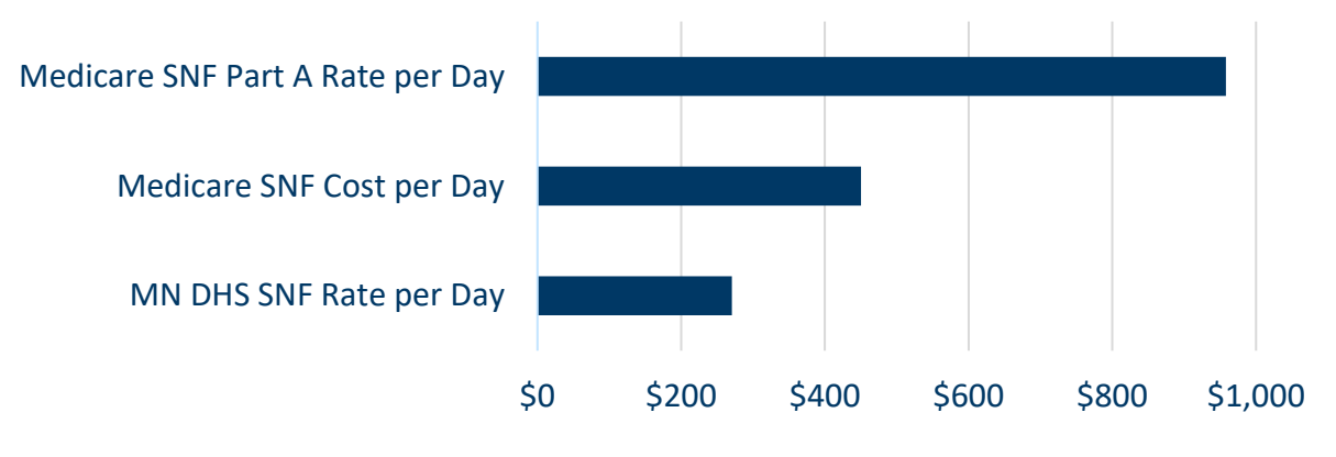
Figure 3. Comparison of Skilled Nursing Facility (SNF) Reimbursement Rate per Day for Medicare and Minnesota Department of Human Services (DHS) in 2020