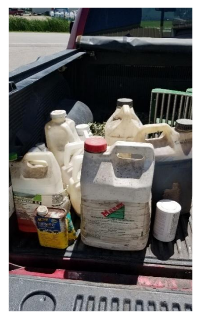
Waste pesticide ready to offload from a pickup truck at a Minnesota agricultural chemical dealership.

In accordance with the Americans with Disabilities Act, this information is available in alternative forms of communication upon request by calling 651-201-6000. TTY users can call the Minnesota Relay Service at 711. The MDA is an equal opportunity employer and provider.