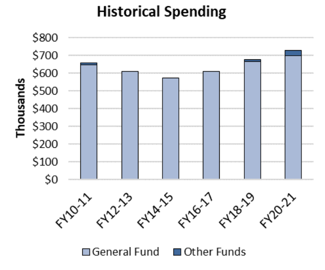
FY18-19 (and FY20-21) reflects costs of developing the new 2040 Comprehensive Plan in house.