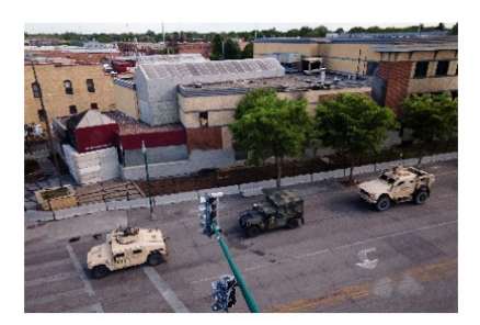
Minnesota National Guard and State Patrol vehicles near 3rd Precinct

civil disturbance and extended period of civil unrest such as what occurred in Minneapolis after Mr. Floyd's murder. For example, the State Patrol's mission is to patrol highways and manage traffic safety (Minnesota Statutes § 299D.03, 2021), not to serve as a state police force. Although they have statewide authority, DNR conservation officers typically provide public safety, natural resource, and recreation protection response in DNR managed areas (Minnesota Statutes § 626.84.1(c), 2021). The vast majority of Minnesota National Guard members are not trained in public order; rather, they are trained in combat. Minnesota Guard members are typically activated to assist the state during disasters and other state emergencies and are trained to serve in times of war as soldiers and airmen. Supporting law enforcement activities during civil disturbance is outside these entities' purview.