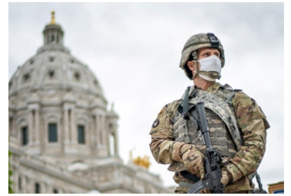
Minnesota National Guard soldier in front of Capitol

Minnesota State Law Enforcement Agencies, including the Minnesota State Patrol, Minnesota Department of Natural Resources Law Enforcement Division, and other agencies, along with the Minnesota National Guard were called upon by the governor to provide services outside of their specific jurisdiction and training. Although these state-level entities were better equipped to respond to this particular crisis than local jurisdictions due to their training, equipment, and number of officers, they did not have experience responding to a large-scale