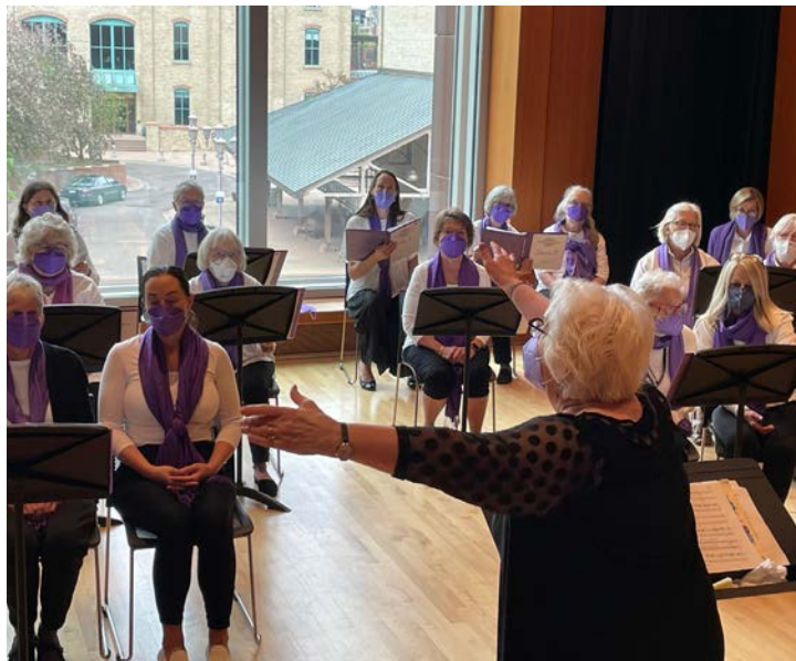
■ GIVING VOICE CHORUS | EDINA