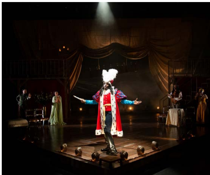
■ GREAT RIVER SHAKESPEARE FESTIVAL, Richard III | WINONA