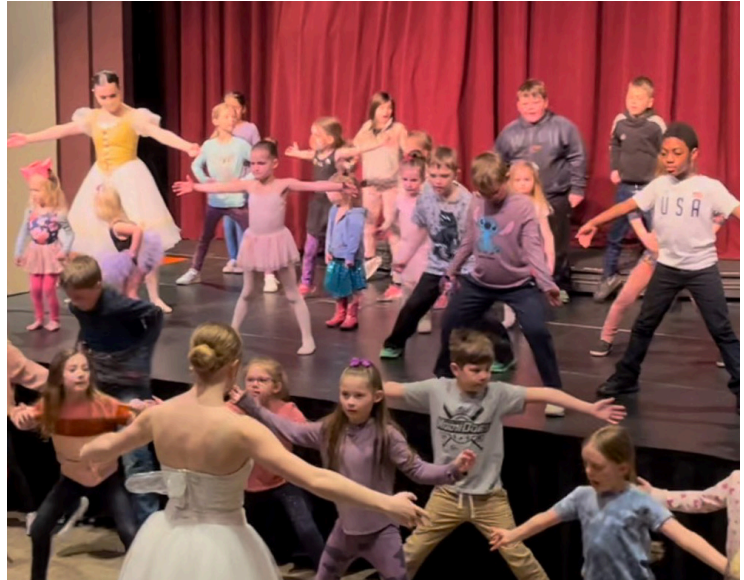
■ TWIN CITIES BALLET, Dance with Me | BURNSVILLE