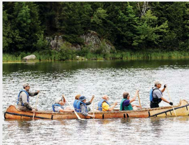
■ ELY FOLK SCHOOL, "Burntside" | ELY