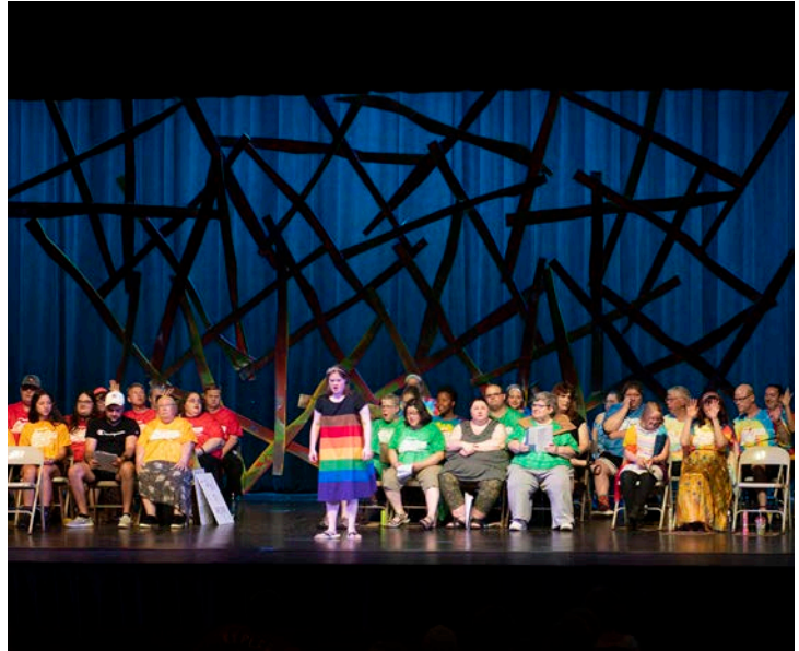
■ OPEN ARTS MN, Aktion Club Theatre | MANKATO

In March 2021, Congress passed the American Rescue Plan Act of 2021, an economic stimulus bill intended to help speed up recovery from the economic and health effects of the COVID-19 pandemic. The act included $135 million, allocated to the National Endowment for the Arts (NEA)