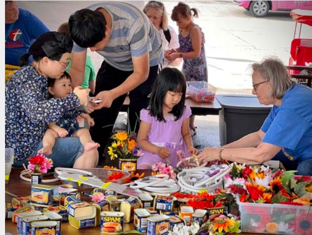
■ Austin Artworks Festival | AUSTIN