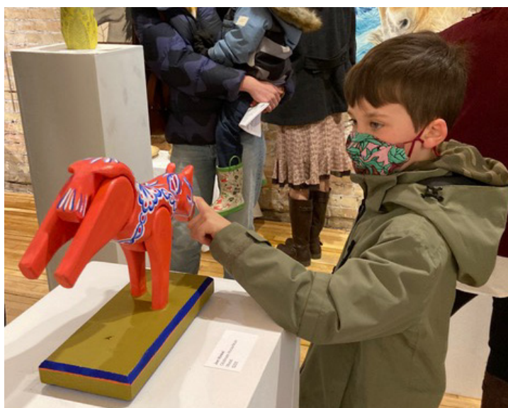
■ NORDIC CENTER, The Horse of Course | DULUTH