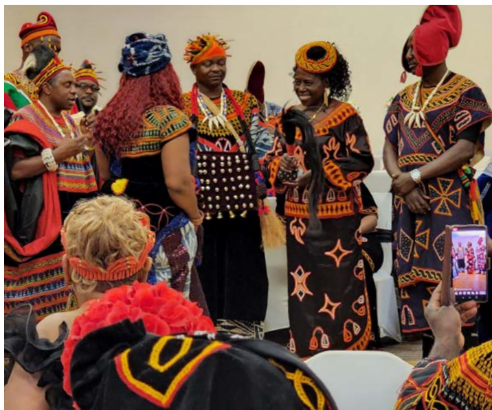
■ BAFUT MANJONG CULTURAL ASSOCIATION MINNESOTA | OTSEGO