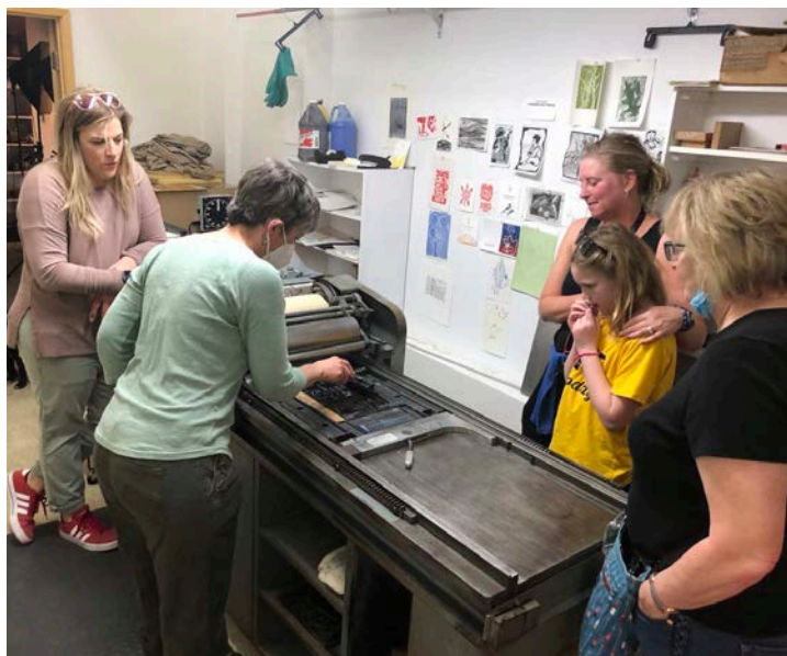
■ MACROSTIE ART CENTER, Printmaking Demonstration | GRAND RAPIDS