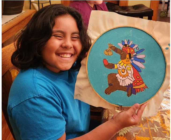
■ KALPULLI OLLIN AYACAXTLY, Aztec Dancer's Shield | NORTHFIELD

The Arts Board continues to provide staff time and resources to support the Minnesota