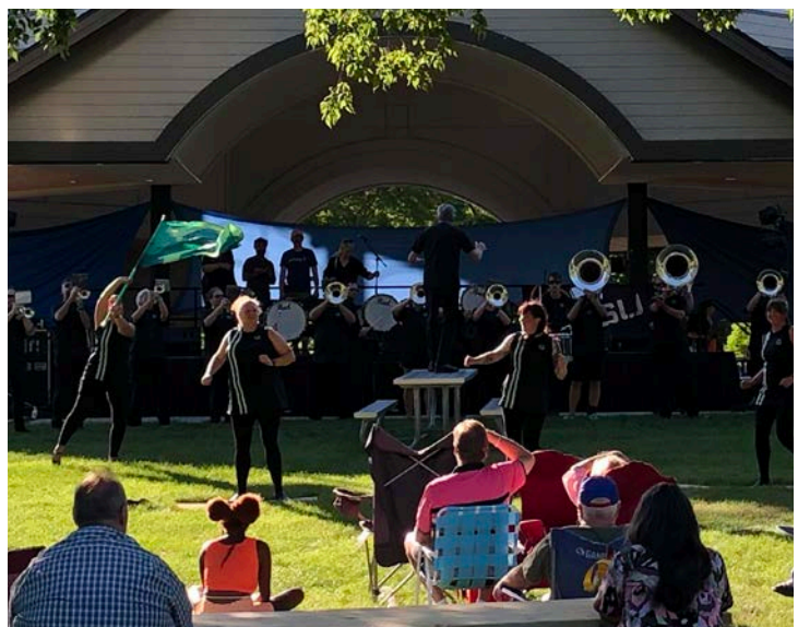
■ MINNESOTA ORIGINAL MUSIC FESTIVAL | SAINT PETER