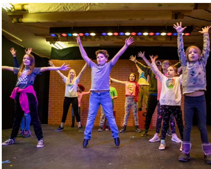
■ LYRIC CENTER FOR THE ARTS | VIRGINIA