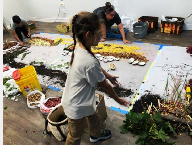
■ Light Up the River Festival | GRANITE FALLS