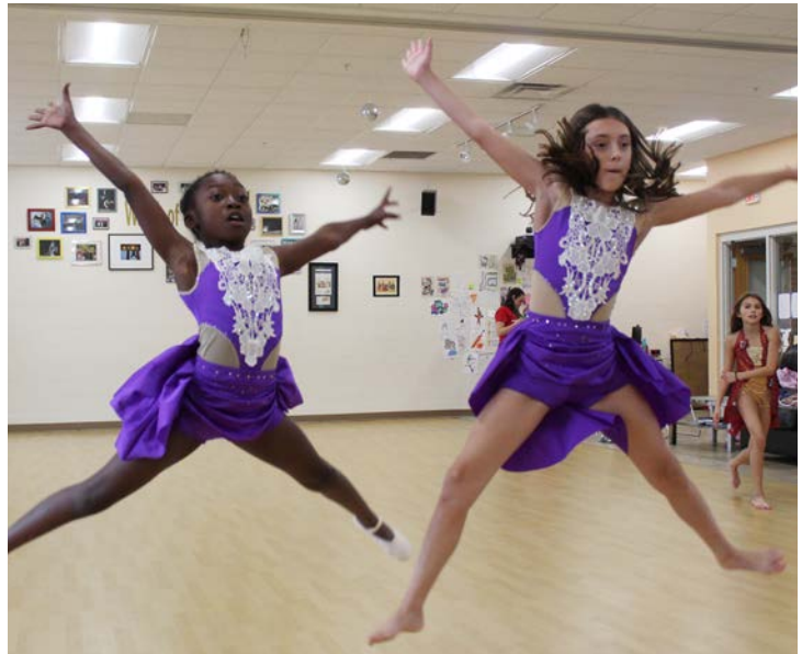
■ BOYS & GIRLS CLUBS OF CENTRAL MINNESOTA | SAINT CLOUD