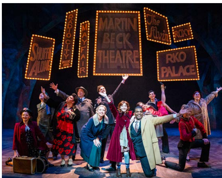
■ DULUTH PLAYHOUSE, Annie | DULUTH