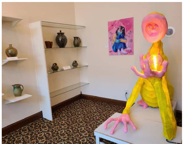
■ FARIBAULT ART CENTER, Emerging Artists Exhibition | FARIBAULT