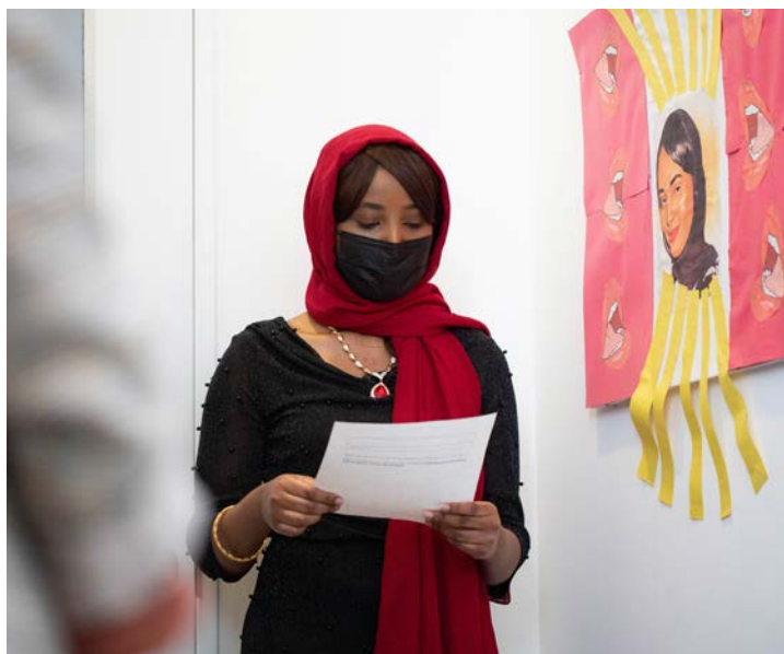
■ ROCHESTER ART CENTER, Counterspaces | ROCHESTER

The State of Minnesota appropriated $41,913,000 to the Minnesota State Arts Board for fiscal year 2022. Of that amount, $7,541,000 came from the state's general fund and $34,372,000 came from the state's arts and cultural heritage fund. This report offers glimpses of how the Arts Board used those funds to support artists and organizations as they took steps to get back on their feet, and it highlights the remarkable ways that those grants were used to build connection, dialogue, self-expression, and economic vitality throughout the state, enhancing the lives of Minnesota residents, and contributing to the health and vitality of their communities.