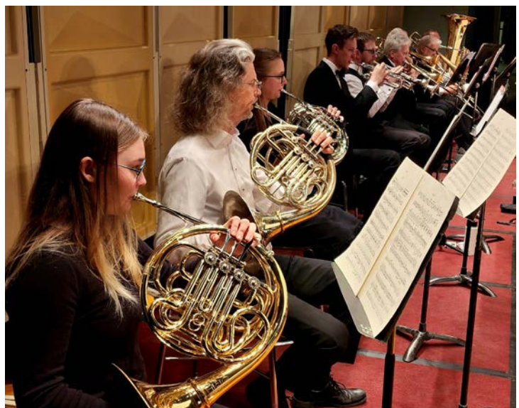
■ MESABI SYMPHONY ORCHESTRA, Musical Jubilee | VIRGINIA