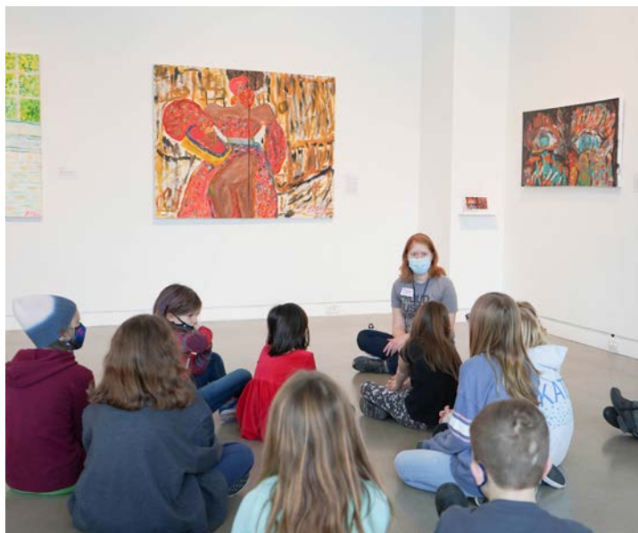
■ ROCHESTER ART CENTER, Winter Art Camp | ROCHESTER