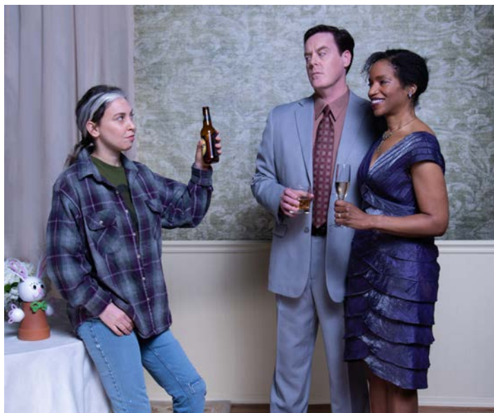
■ COMMONWEAL THEATRE COMPANY, Good People | LANESBORO