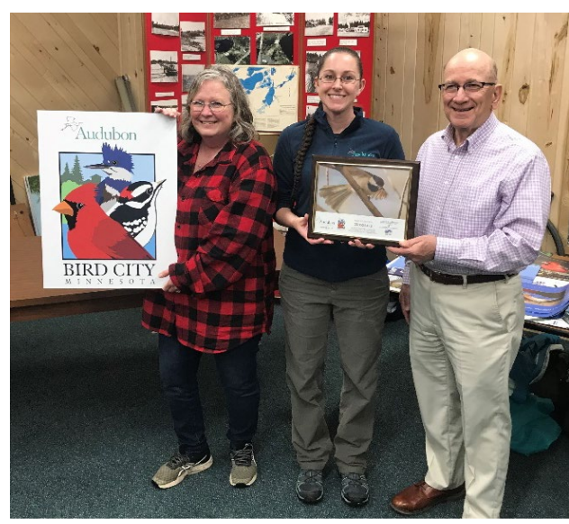
Crosslake new Bird City 2019