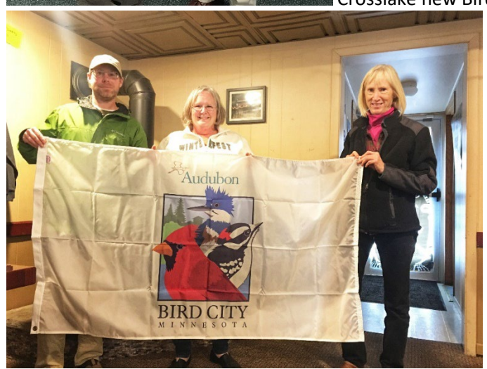
Crosslake new Bird City 2019