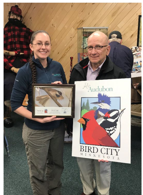
Crosslake new Bird City 2019