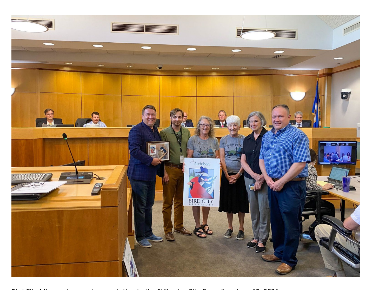
Bird City Minnesota award presentation to the Stillwater City Council on June 15, 2021