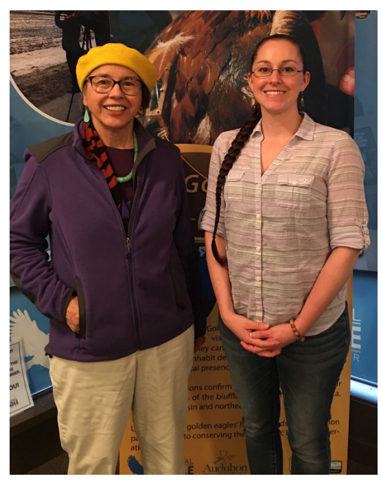
Wabasha new Bird City 2019- pic advisory group lead