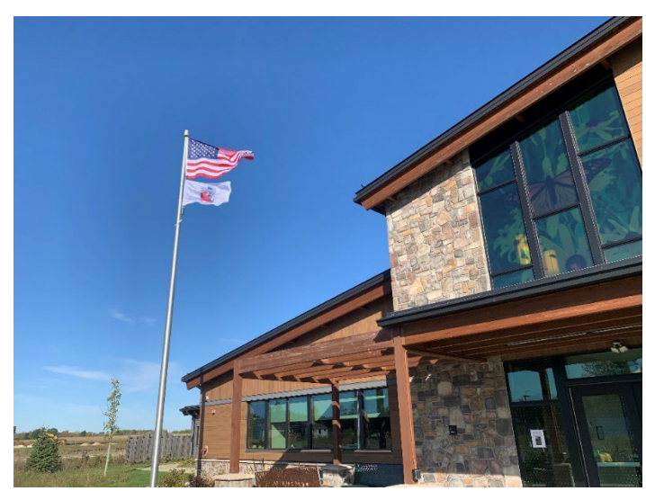
Austin Bird City flag 2019