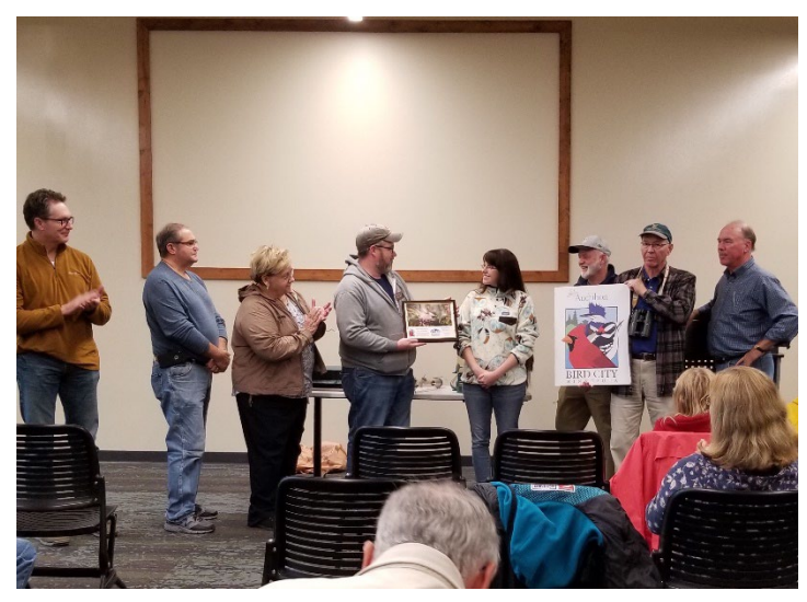
Austin, MN Bird City recognition event