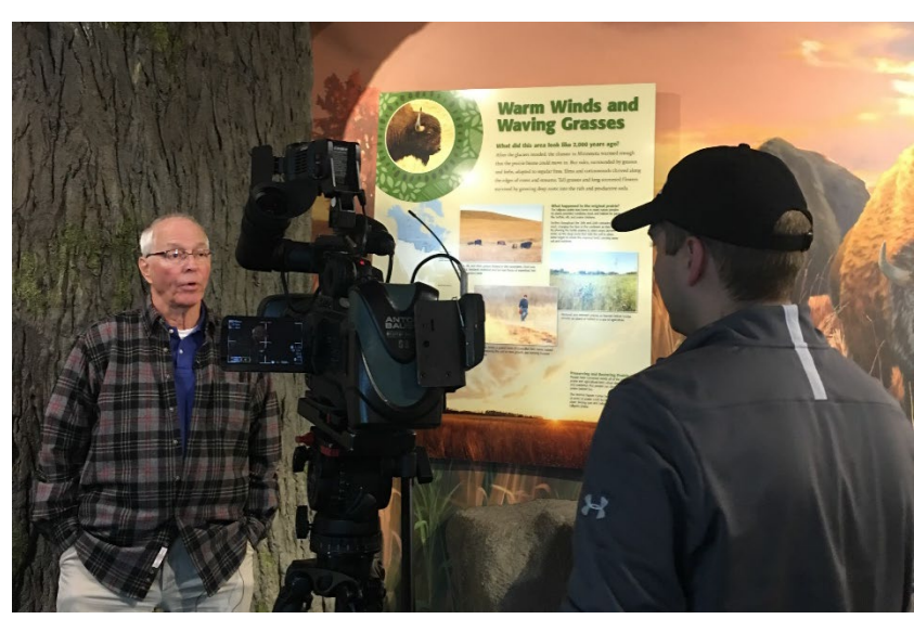
Austin new Bird City news 2019