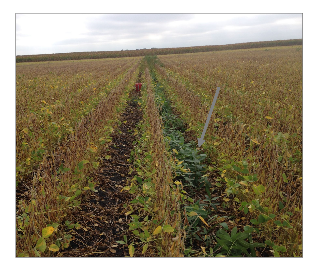
Figure 2. Milkweeds established between soybean rows after one growing season