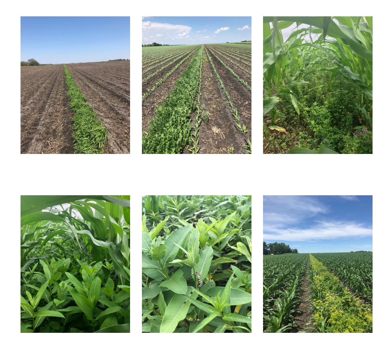
Figure 3. Clockwise from upper left. i) Savanna grasses (Bottlebrush grass + Woodland Brome) in May, prior to corn planting. ii) Alfalfa strip growing well just after corn planting. iii) same strip of alfalfa in early July, flowering under corn canopy. iv) Milkweed strip under corn canopy in late June—nearly in flower. v) Monarch larva feeding on Milkweed strip. vii) Mixed prairie strip with Golden Alexander in full flower- early June.