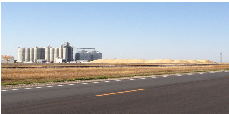
Soybeans awaiting shipment at MarKit Grain Terminal, Argyle, MN.