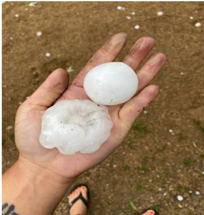
Hail affected an area 16 miles north of Bagley between Tenstrike and Turtle River, July 26, 2021.

Other projects involved Senior Disaster Preparation presentations, Emergency Operations Plan Template creation, participating with Minnesota National Guard in a mass sheltering exercise, meeting with Manitoba emergency management personnel to partner on future initiatives and disaster response, updates to Threat and Hazard Identification and Risk Assessment Plan (THIRA), pet sheltering, creation of a regional resource manual, credentialing, regional EOC planning and regional response exercises.