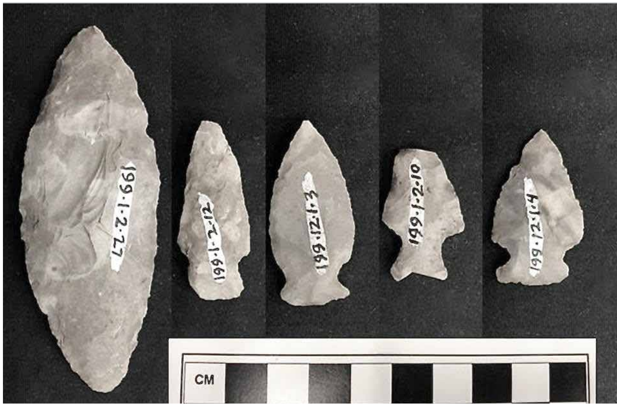
Above: These are tools, or ‘bifaces,’ made of Grand Meadow Chert, and found within 10 miles of the Quarry when the site was first recorded in 1980 during the Statewide Archaeological Survey. From the MNHS Collections.