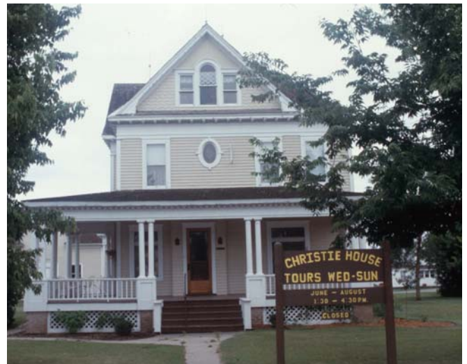
Dr. George R. Christie House, Long Prairie, Todd County