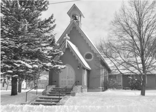
Gethsemane Episcopal Church, Appleton, Swift County