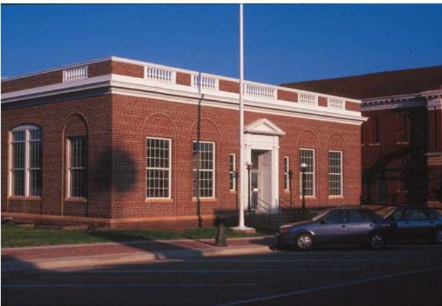
United States Post Office, Fairmont, Martin County