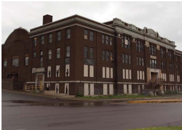
Duluth Armory, Duluth, Saint Louis County