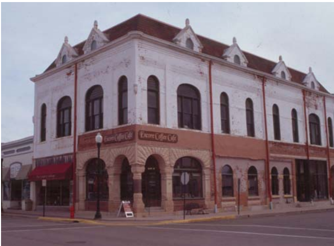
Grand Opera House, St. James, Watonwan County

This analysis of statewide factors affecting historic resources draws on a number of sources, including: