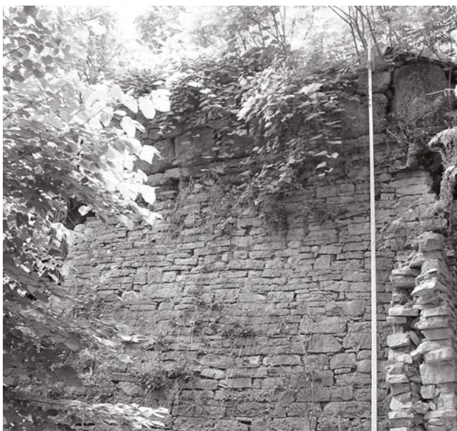
Stillwater South Main Street Archaeological District (DOE), Stillwater, Washington County