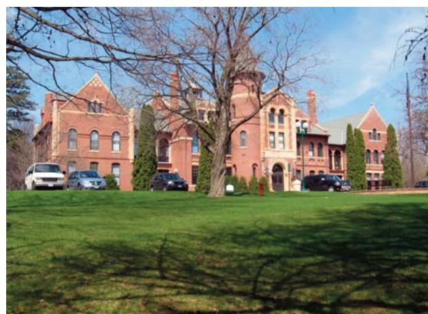
Minnesota State Public School for Dependent and Neglected Children, Owatonna, Steele County