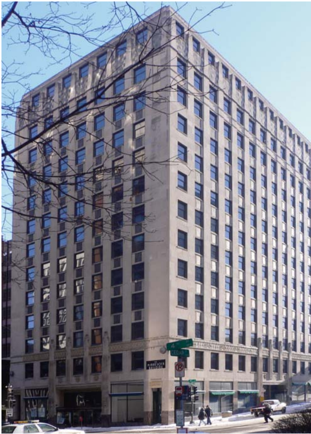
Minnesota Building, St. Paul, Ramsey County