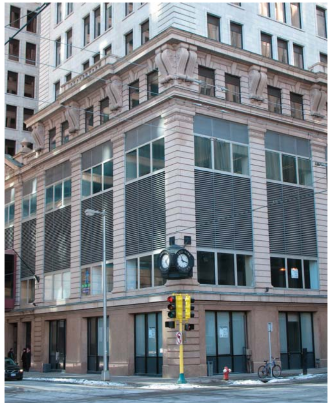
First National Bank — Soo Line Building, Minneapolis, Hennepin County