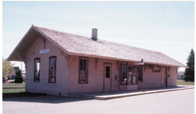
Little Falls and Dakota Depot, Starbuck, Pope County