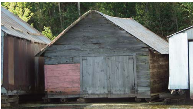
Stuntz Bay Boathouse Historic District, Breitung Twp., Saint Louis County

Information generated by all of these surveys is available at the Minnesota SHPO for use by the public and for research and planning by government agencies. Much of the data