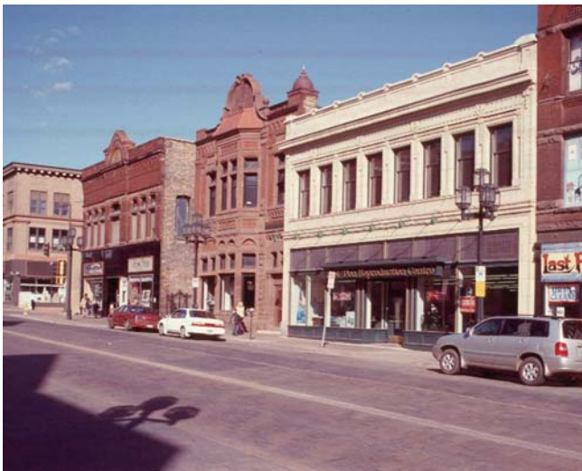
Duluth Commercial Historic District, Duluth, Saint Louis County