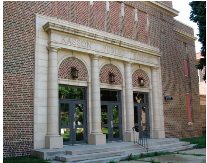
Kasson Public School, Kasson, Dodge County