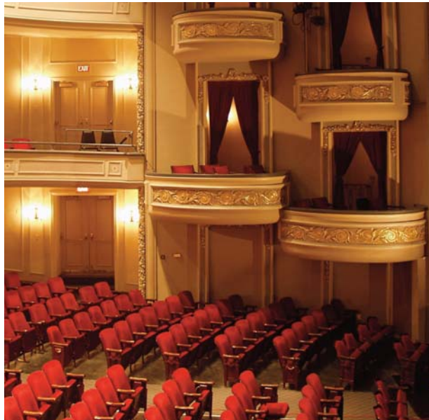
Sam S. Shubert Theatre, St. Paul, Ramsey County

These pertain to state Environmental Assessment Worksheets and Environmental Impact Statements.