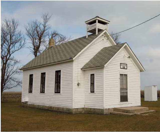
District No. 44 School, Taylor Twp., Traverse County