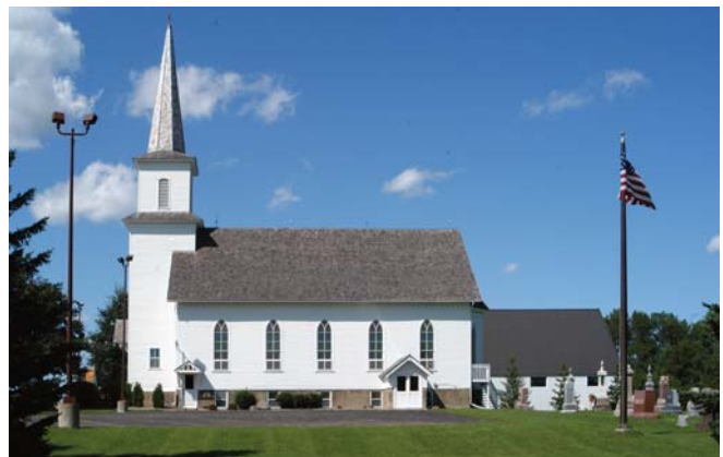
Christiania Lutheran Free Church, Eureka Twp., Crow Wing County

Agency Participation: The SHPO conducted planning sessions with state and federal agency personnel, local