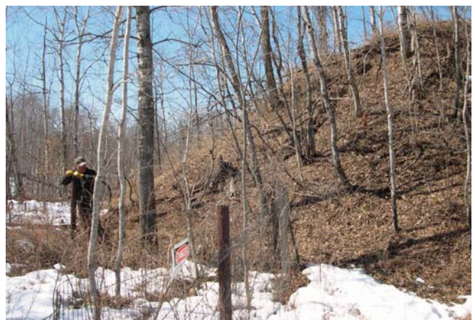
Milford Mine Historic District, Wolford Twp., Crow Wing County