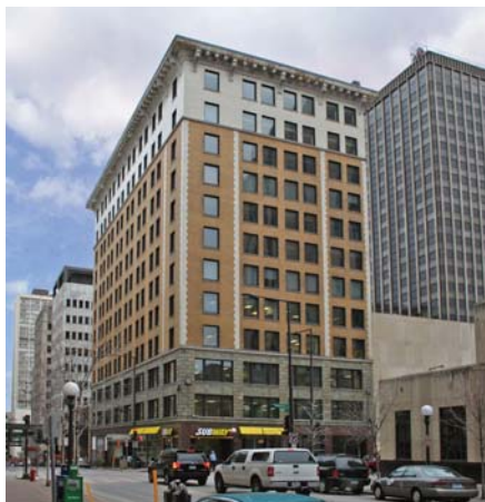
Commerce Building, St. Paul, Ramsey County

A majority of the state's historic resources are in the hands of private property owners and developers, a group that is key to the success of resource preservation statewide. Many of those individuals appreciate the historical and architectural significance of their properties, but others remain unaware of their properties' importance. Owners also have varying means and abilities to care for their historic properties. The availability of state historic rehabilitation tax credits to augment the federal tax credits is attracting significant attention from property owners and developers.