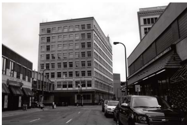
Pence Automobile Company Building, Minneapolis, Hennepin County