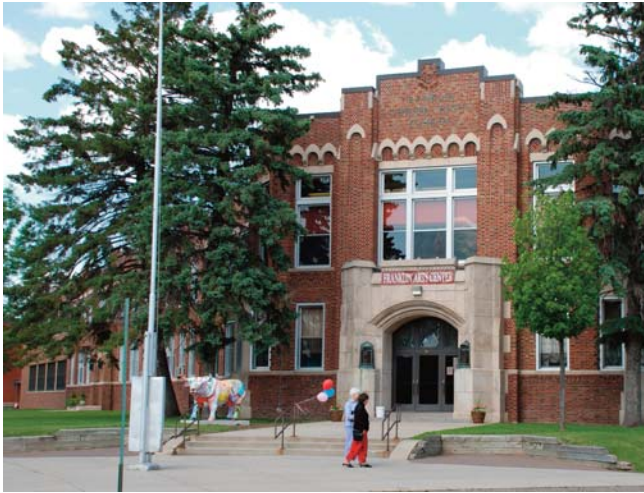
Franklin Junior High School, Brainerd, Crow Wing County