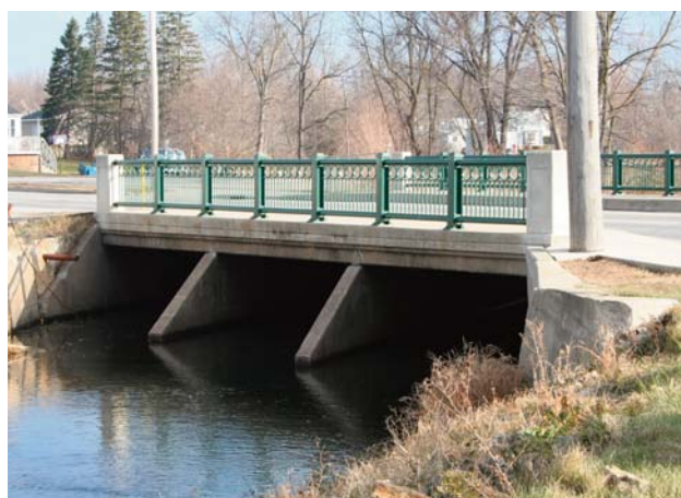
Bridge No. 5722, Spring Valley, Fillmore County

■ Since the last statewide preservation plan was issued in 2006, the Preservation Alliance of Minnesota has made major strides. Membership now exceeds 500, the