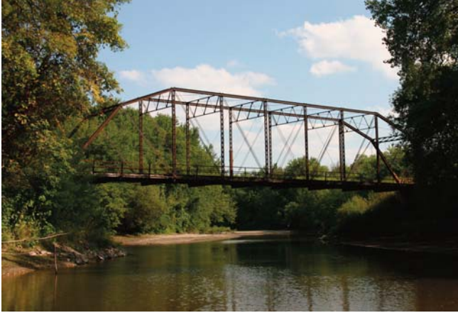
Dodd Ford Bridge, Shelby Twp., Blue Earth County

forums and reviewing the statewide plan draft. Among their suggestions: