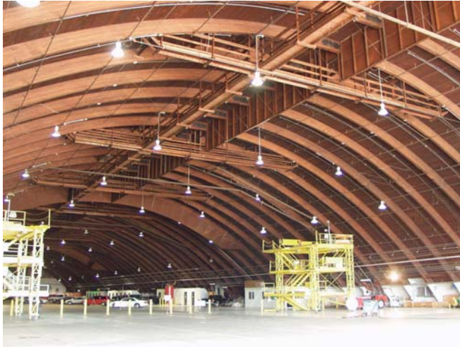
Riverside Hangar, St. Paul, Ramsey County

Minnesota's historic and archaeological resources are as rich and diverse as its people and its landscape. Each community has a character all its own, whether it's the rugged landscape of the Iron Range, the wide open prairies of the southwest, the charming main street of a small river town or the warehouse district of a major metropolitan area. And our story is a patchwork of the contributions of generations who came before us. Varied as we are, the people of Minnesota share a deep sense of place. It is the responsibility of each of us to preserve that legacy for future generations.