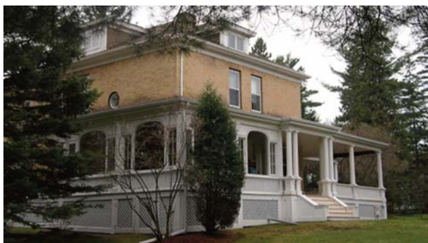
Henry C. Oldenburg House, Carlton, Carlton County

■ Expand survey and designation efforts to include properties associated with underrepresented groups and to assure that all regions of the state are fairly represented and served.