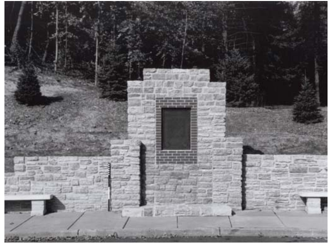
Chaska Historical Marker, Chaska, Carver County