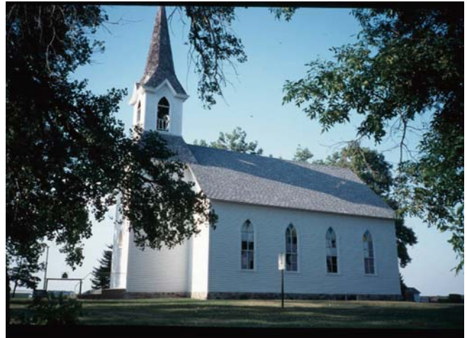
St. Paul Norwegian Evangelical Lutheran Church, Almond Twp., Big Stone County

• On file at the State Historic Preservation Office, Minnesota Historical Society, St. Paul.