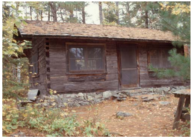
Listening Point, Morse Twp., Saint Louis County