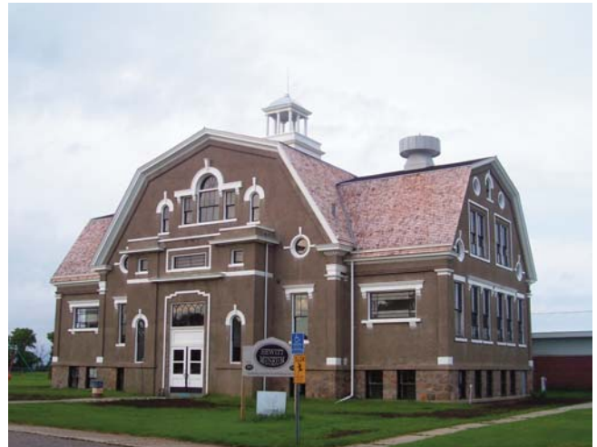
Hewitt Public School, Hewitt, Todd County