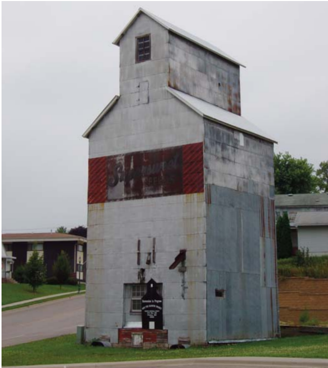
Milwaukee Elevator, Preston, Fillmore County

budget has increased nearly fourfold, and its staff grew from one part-time employee to four full-time positions, including a field representative and a Main Street coordinator. Through these expansions, the Preservation Alliance of Minnesota now truly fulfills its role of serving communities across the state.