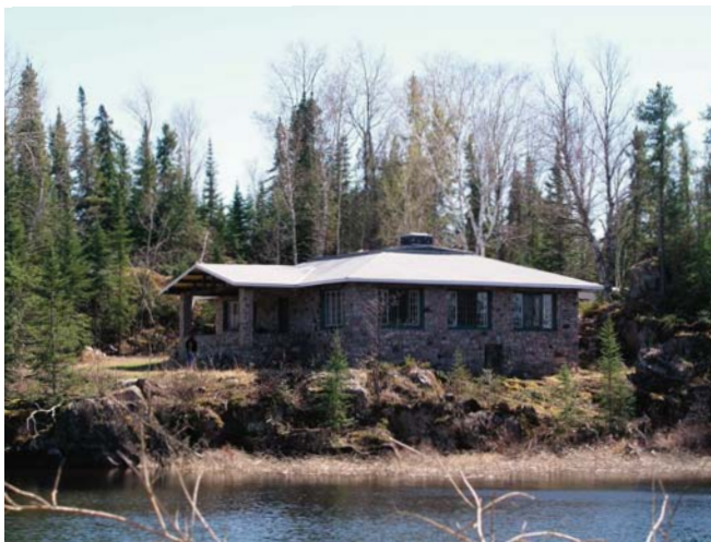
Chik Wauk Lodge, Unorganized Territory, Cook County