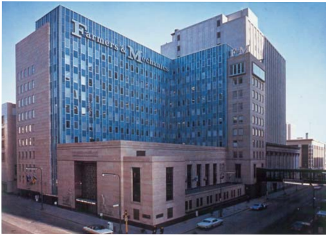
Farmers and Mechanics Savings Bank, Minneapolis, Hennepin County

shift over the next decade as baby boomers reach retirement age. And the labor force is likely to shrink as the number of retirees outpaces the number of younger Minnesotans entering the job market.