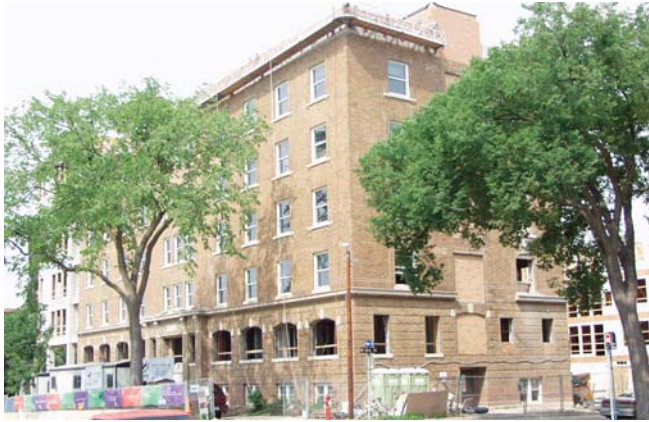
Eitel Hospital, Minneapolis, Hennepin County

Mille Lacs, Leech Lake and White Earth bands of Ojibwe as tribes with THPOs were the Bois Forte Band of Chippewa Indians, the Fond du Lac Band of Lake Superior Chippewa, the Grand Portage Band of Lake Superior Chippewa, the Lower Sioux Indian Community and the Upper Sioux Indian Community. The National Park Service designates these tribes, at their request, to play a role parallel to the SHPO in administering preservation programs on their reservations. Minnesota THPOs have focused on archaeological sites and traditional cultural properties and are now working with the SHPO on other types of historic resources. They are also increasing collaboration among tribes.