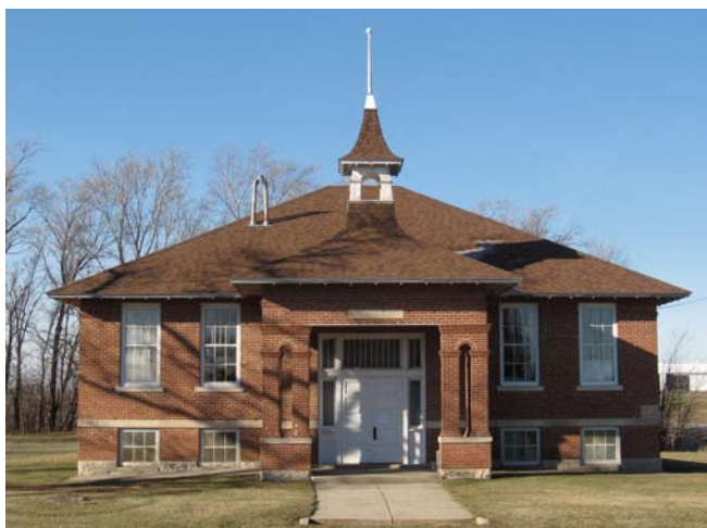
Komensky School, Hutchinson Twp., McLeod County

DOCOMOMO US MN, Dodd Ford Road Bridge Association, Friends of Christ Church Lutheran, Friends of Floral Hall, Friends of the Kirkbride, Friends of the Riverfront, Greater Litchfield Opera House Association, Jackson Preservation Alliance, Kasson Alliance for Restoration, Preserve Minneapolis, Minneapolis Historic Homeowners Association, and the Prairie Skyline Foundation. These groups join the ranks of established community and neighborhood organizations such as Historic St. Paul, the Duluth Preservation Alliance and the St. Cloud Historical and Neighborhood Preservation Association.