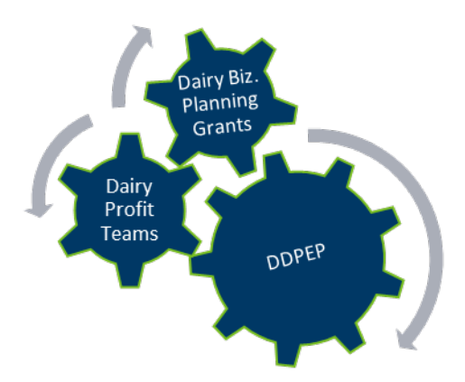
Figure 1. The DDPEP powers Dairy Profit Teams and Dairy Business Planning Grants.

The MDA administers this program by granting funds to the Minnesota Dairy Initiative (MDI). MDI coordinates the dairy profit teams so they can assist dairy farmers. Some of the partners that contribute to the success of this program are the Sustainable Farming Association, Minnesota Milk Producers Association, University of Minnesota, University of Minnesota Extension, Minnesota State Colleges and Universities Farm Business Management (FBM), and other industry groups.