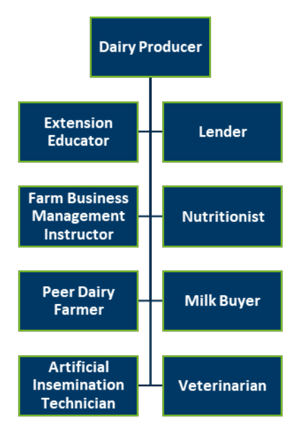
Figure 2. Members on a typical Dairy Profit Team.

In FY21, 238 dairy farms milking a total of 50,458 cows participated in the program (Map 1, Appendix A). This represents 10% of the dairy farms and 11% of the dairy cows in the state.