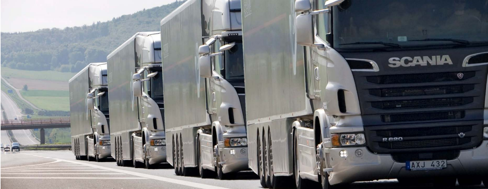
Truck Platoon Demonstration in Europe