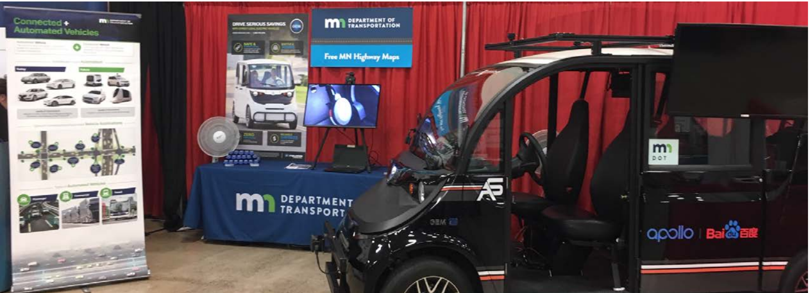
State Fair Automated Vehicle Demonstration