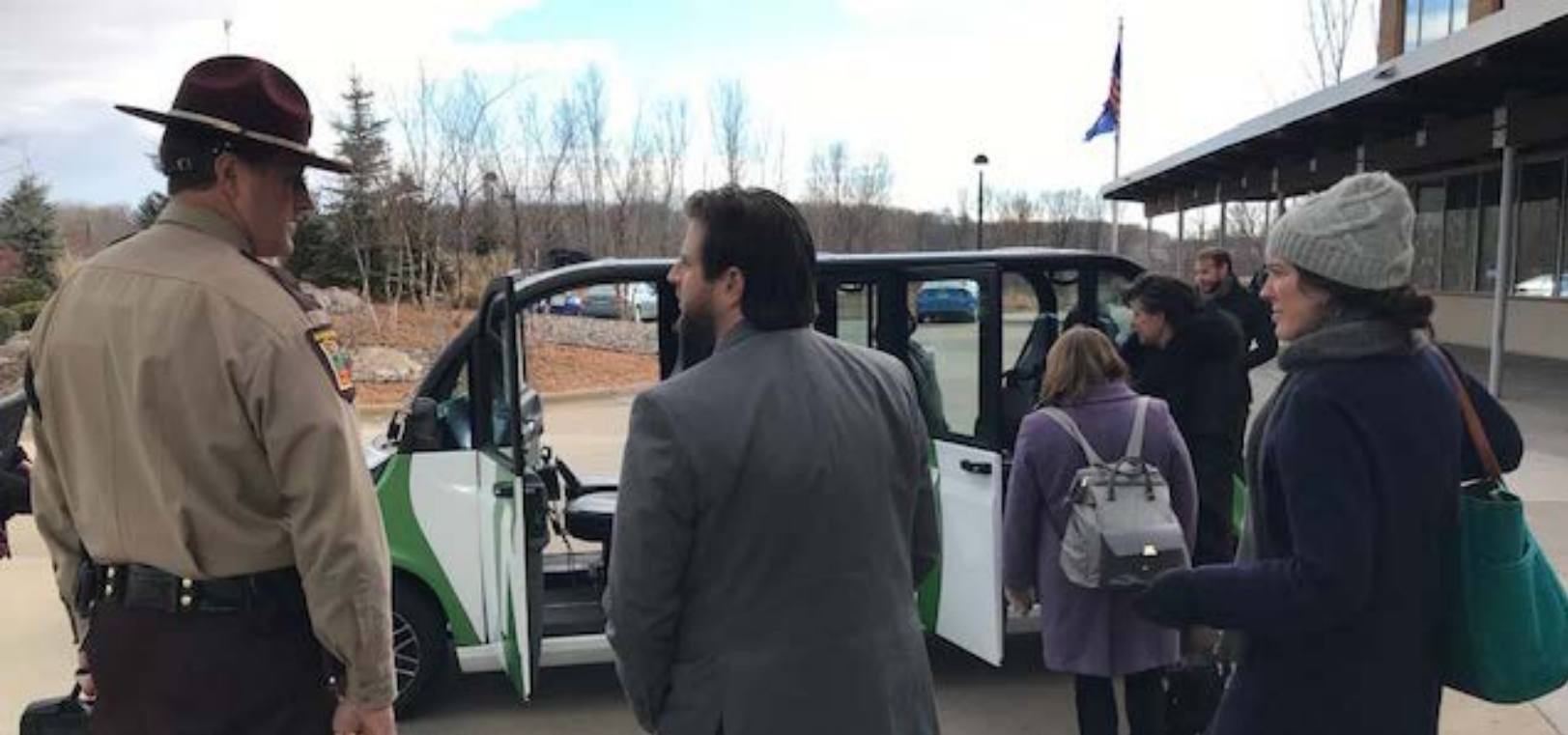
Autonomous Shuttle Demonstration at November 2019 Advisory Council Meeting