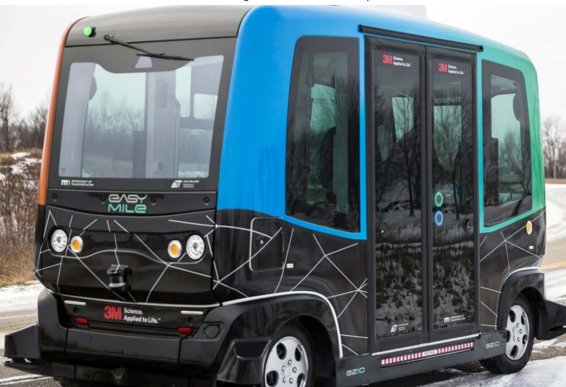
Autonomous Shuttle Winter Weather Testing at MnDOT MnROAD Facility

The Minnesota County Engineers Association created a CAV committee, which meets regularly to coordinate on CAV topics. They also helped to develop Preparing Local Agencies for the Future of CAV , a report on how local agencies can leverage current activities and resources to prepare for CAVs.