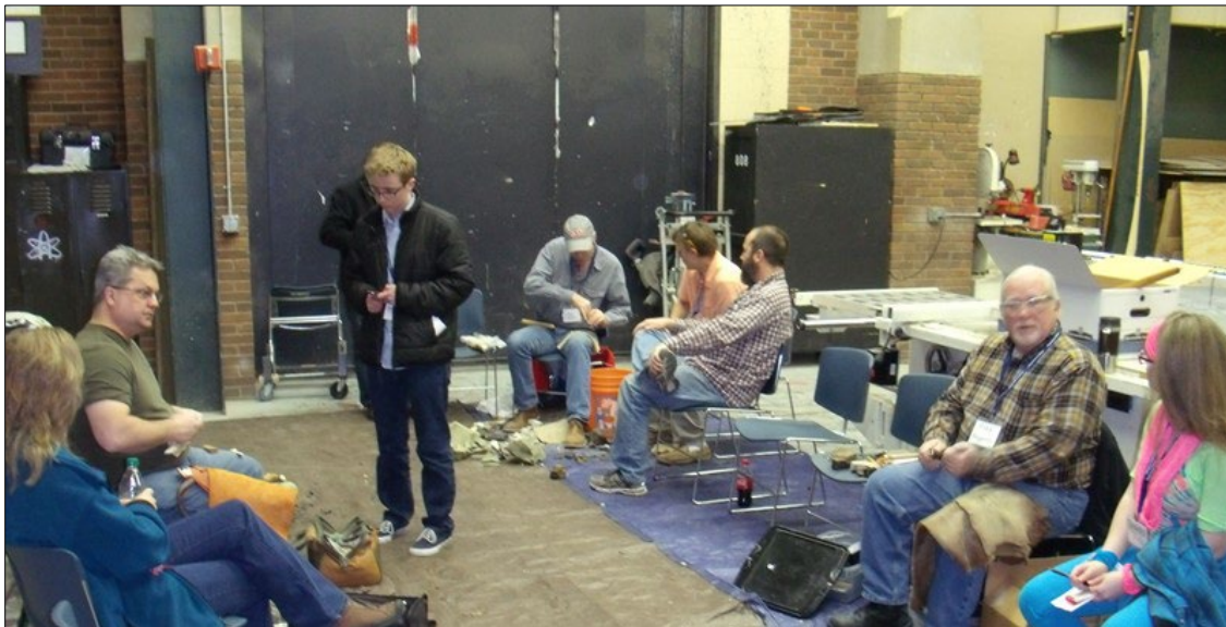
Figure 1. Lithic Workshop organized by the OSA.

The Office of the State Archaeologist (OSA) strives to preserve archaeological sites and unplatted burials, encourage communication between state agencies, foster collaboration between the archaeological and tribal communities, assist with development planning, and promote archaeological research and education in Minnesota (Figure 1). We work with developers, tribal representatives, governmental agencies, educators, and the public to identify, preserve, and interpret our archaeological resources.