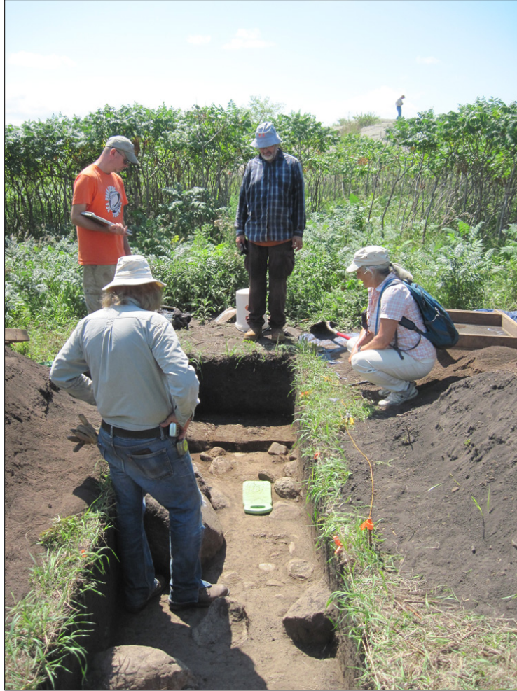
Figure 6. Photograph of archaeological excavation at 21LP11.

The purpose of the Minnesota Radiocarbon Dating Study is to summarize what is known about absolute dating in Minnesota, evaluate dating methods, test and analyze archaeological samples, and provide directions for future research, while the Minnesota Stone Tool Handbook project created a comprehensive, well-illustrated overview of the prehistoric stone tools of Minnesota. The remaining two projects focused on archaeological field work. The Lac Qui Parle County Survey project will summarize what is known about the early human occupation of the county, update the OSA's site files, and identify unrecorded prehistoric and early historic sites, and the Archaeological Survey of the Fort Snelling Area focuses on redefining the boundary of the Fort Snelling National Register District, finding important sites within the district, and to summarizing the district's archaeological potential.