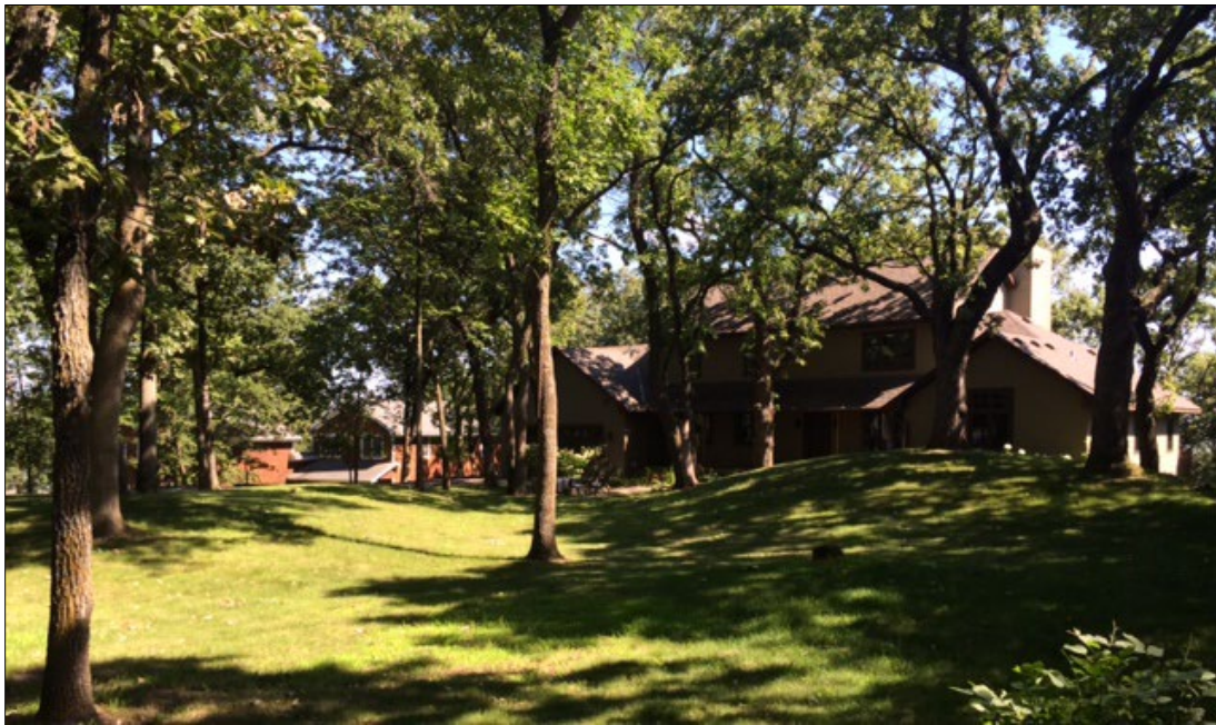
Figure 3. Photograph of burial mounds in Stearns County.