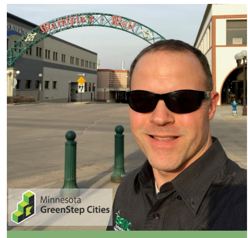
NEW ULM JOINS GREENSTEP CITIES PROGRAM

Access the story map: https://bit.ly/3mCkpgs Access the mapping tool: https://bit.ly/3gzauEw