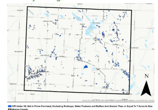
Primary Siting Scenario

that asked questions such as, "In what ways can you see solar as being beneficial or burdensome in Murray County?"