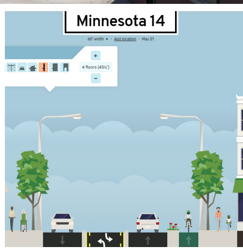
Student's vision of Tracy roadway using streetmix.net's street programming.

Tracy residents will soon see an invitation to participate in