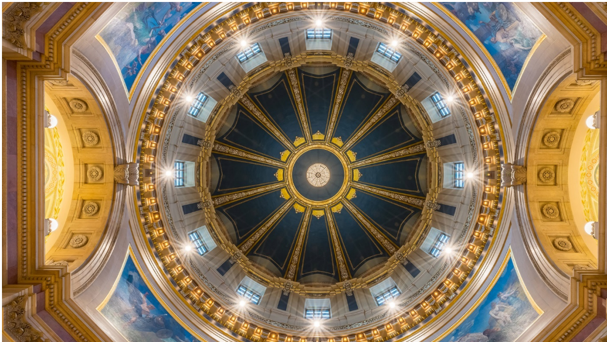
Minnesota Capitol Rotunda, with the electrolier lit for the opening of the 2020 Legislative Session.

Roughly 50 percent of the ILR appropriation is allocated to the Capitol Building. The ILR appropriation will need to be adjusted periodically in order to allow for major maintenance items such as painting and caulking, as will the rent rates for the non-ILR space. Periodic bonding requests will also be necessary over time to ensure that repairs and asset preservation work such as stone repairs, tuck pointing, roof and system replacement can take place as needed.