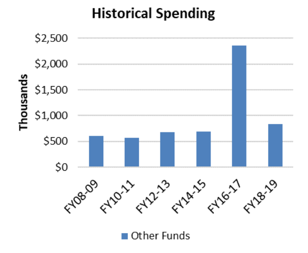
FY 14-15 includes spending for Physical Therapy. FY 16-17 includes Health Professionals Services Program (HPSP) and Physical Therapy spending.