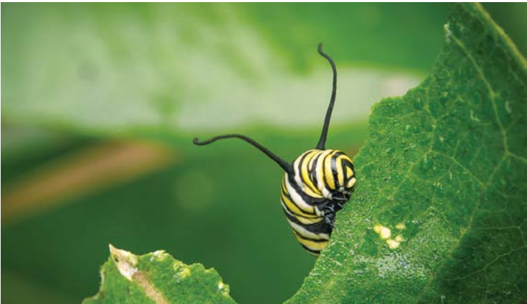
A monarch caterpillar eating milkweed leaves.