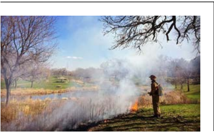
Non-chemical pest control methods, such as prescribed burning, can be effective in many situations.