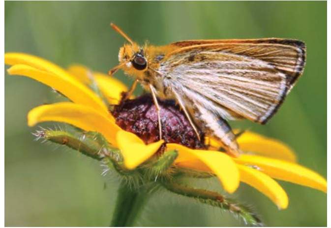
Endangered Poweshiek skipperling butterfly reared by the Minnesota Zoo.