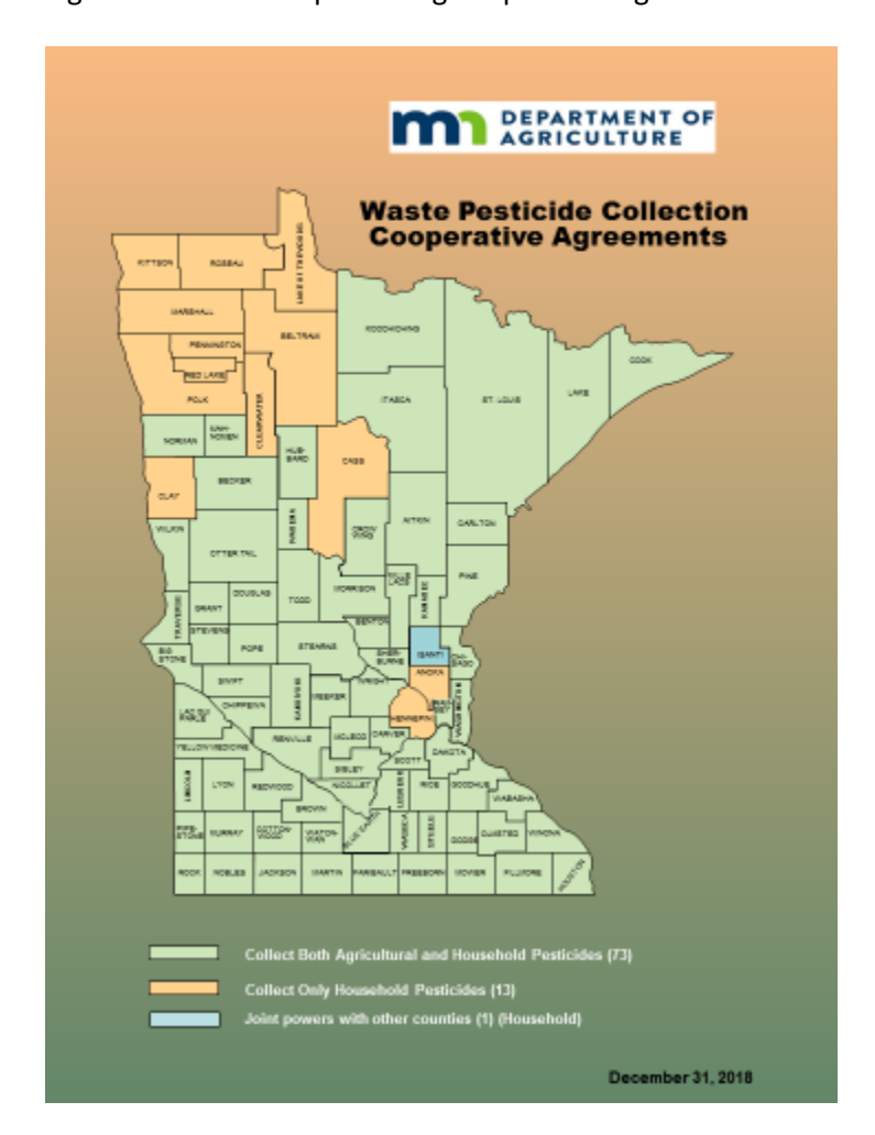
Figure 1. A state map showing cooperative agreements.