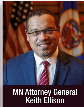
MN Attorney General Keith Ellison