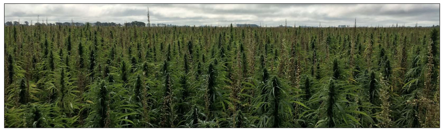
Figure 3: Hemp Field in Polk County

None of the growers reported applying pesticides. There are no pesticides that are labeled for use on hemp. Seven growers reported that they used glyphosate or other pre-emergence herbicide to kill weeds in the field prior to planting. One grower reported that the hemp was very sensitive to residual herbicides from previous seasons that was still present in the soil and advised growers to check their labels carefully when considering to rotate hemp with other traditional row crops.