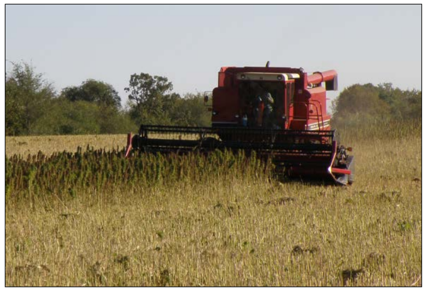
Figure 4: Combining Hemp Grain

Many growers commented that the harvested grain was difficult to clean and dry. Because of the wrapping problems when the crop gets too dry, and also the specter of seed shattering and bird predation, it is better to harvest a little earlier than you would normally think to. Because of that, you end up with high-moisture grain that has to be dried immediately to avoid spoilage. Also there was a lot of green material and weed seeds in the grain, and this made it more difficult to clean and dry down properly. There were 4 growers that had grain get hot and spoil because it did not get on air immediately. This can be a common issue with oilseed crops, so growers that don't have experience with that will need to handle their harvest using different methods.