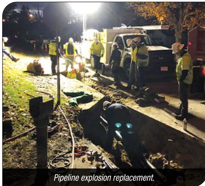
Pipeline explosion replacement.

And in December, HSEM's Brian Curtice traveled to southern California to fulfill an EMAC mission following November's devastating and deadly wildfires. While there, he assisted wildfire survivors in registering for FEMA's disaster assistance program, which includes valuable resources such as shelter, unemployment, crisis counseling and legal services.