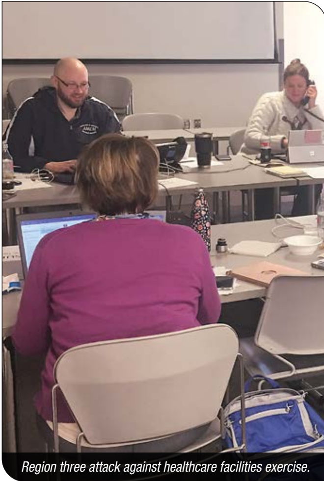
Region three attack against healthcare facilities exercise.