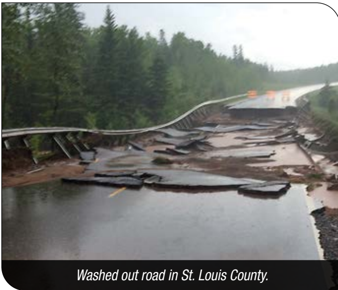
Washed out road in St. Louis County.

On the evening of August 27 through the morning of August 28, heavy rains fell, totaling nine inches. The persistent rain caused flash flooding in the city of Hokah to the point that Thompson Creek was rerouted and the creek no longer flowed over the falls. This caused significant damage to the historic Como Falls Park, which dates back to the 1800s. A state disaster was declared to assist the local officials in Houston County and the city of Hokah to begin the recovery process and try to restore Como Falls.