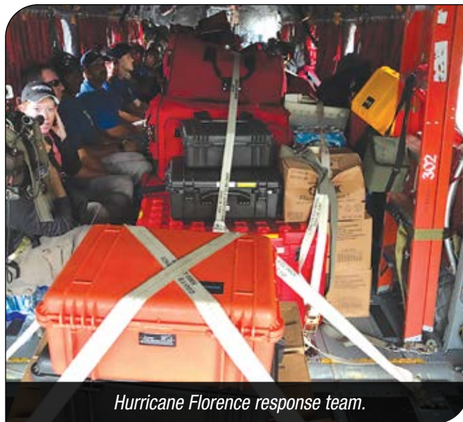
Hurricane Florence response team.