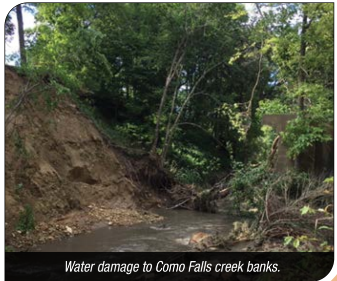
Water damage to Como Falls creek banks.