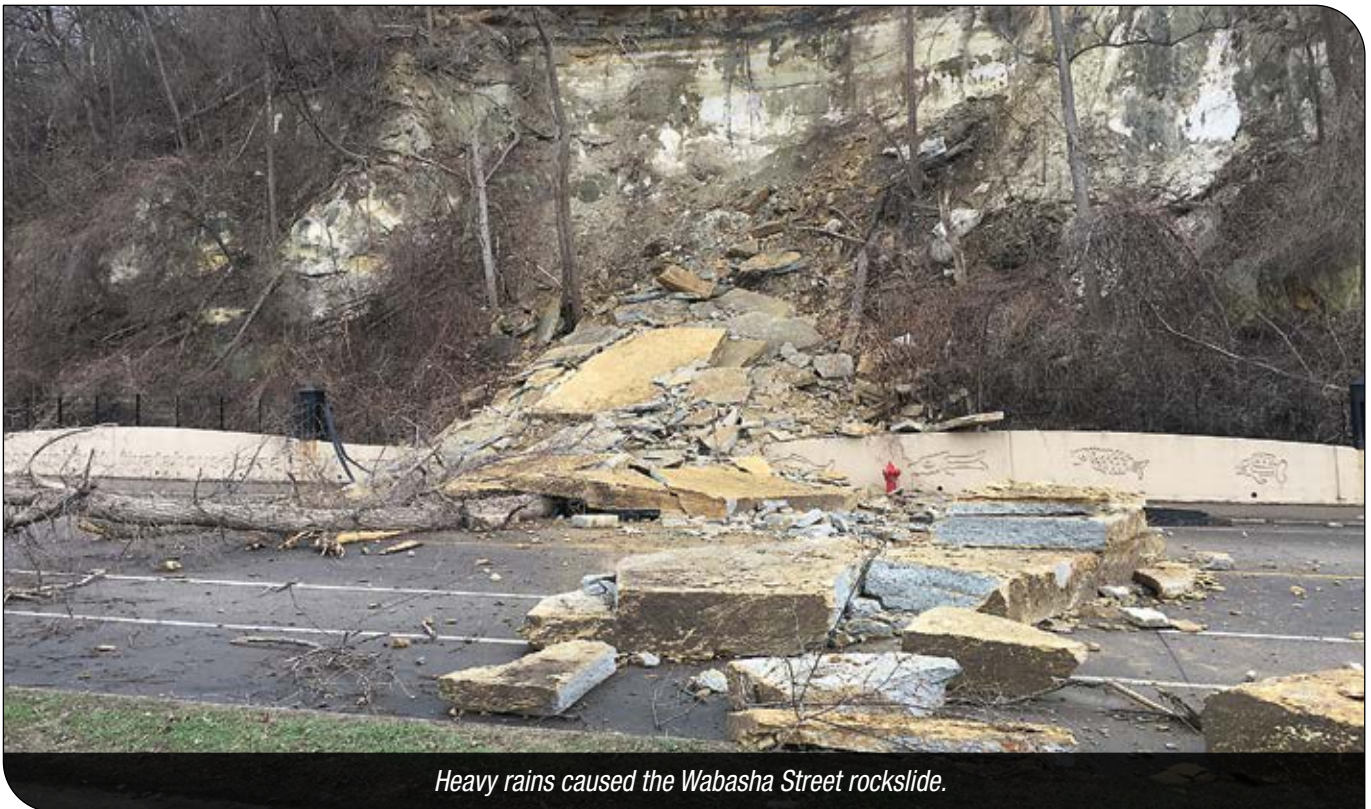
Heavy rains caused the Wabasha Street rockslide.

Gov. Mark Dayton authorized a state disaster for Ramsey County in April. The authorization was in response to a rockslide on Wabasha Street in St. Paul. Ramsey County was reimbursed from the State Disaster Assistance Contingency Account for eligible costs that included debris cleanup and repairs to stabilize the slope. Mitigation measures will be necessary to prevent another slope failure in the future.