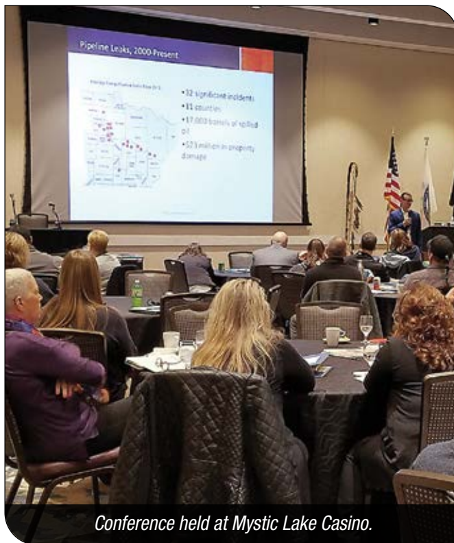
Conference held at Mystic Lake Casino.

That visual evidence was just the tip of the iceberg in terms of what local and federal agencies were doing to keep football fans and non-fans alike safe Super Bowl weekend. But what you didn't see was Minnesota's Department of Public Safety Homeland Security and Emergency Management (HSEM) division waiting quietly in the background, ready to lend support and resources should the need arise.