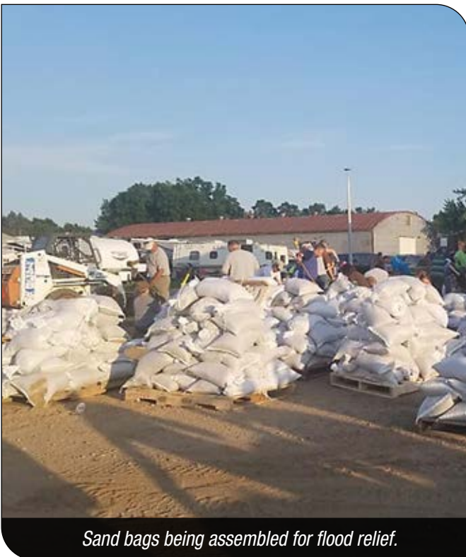
Sand bags being assembled for flood relief.

The FEMA DR-4290 case (severe storms and flooding September 21-26, 2016) has been successfully entered into EM Grants Pro, allowing HSEM to record data through the portal where it can be accessed and shared by all involved parties. HSEM will also manage upcoming state declarations through the portal. Applicants have access to information on funding, payments and status of their grants. Applicants also have the ability to electronically submit applications, reimbursement requests and closeout documentation. Being able to share and access data will promote transparency and enable the applicant to become a working partner in the administration and management of their grant, which ultimately will expedite the recovery process.