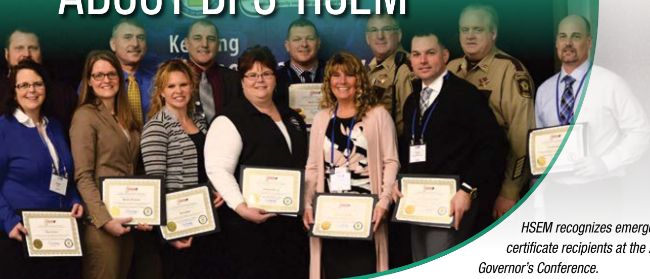
HSEM recognizes emergency management certificate recipients at the 2018 HSEM Governor's Conference.