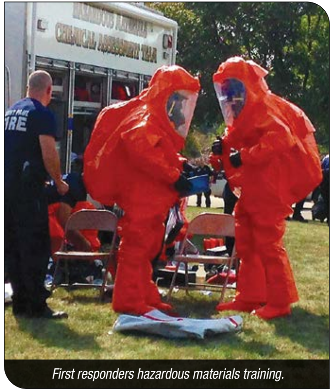
First responders hazardous materials training.

In preparation for the exercise, HSEM conducted over 50 training sessions for state and local responders that include fire, EMS, hospitals, schools and field team personnel.