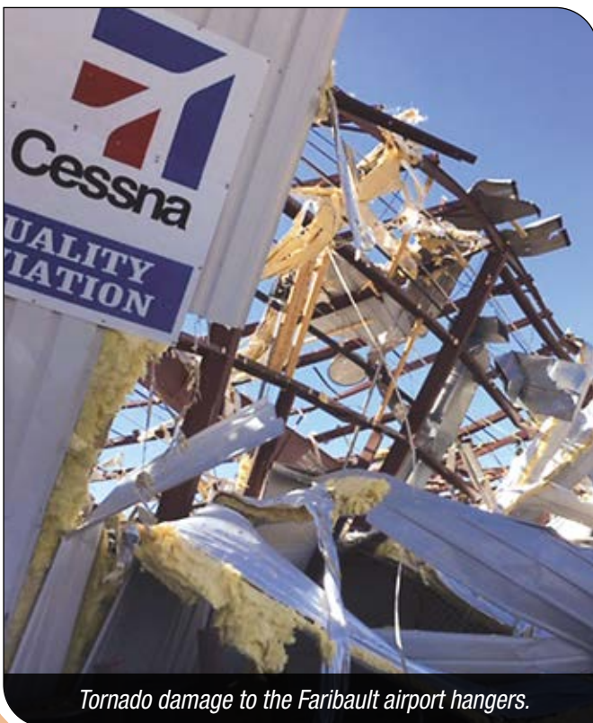
Tornado damage to the Faribault airport hangers.

On September 20 at about 5:45 p.m., a severe weather front moved through southeast Minnesota. The severe weather system spun up 24 confirmed funnels across the area, making it the third largest tornado outbreak in Minnesota history. Rice County received the most damage, and the Faribault airport sustained a direct hit from an EF2 tornado. Several structures and aircrafts at the airport were damaged. The Cannon River Wilderness Area in Rice County was so severely damaged by downed trees that a month after the tornado, officials were still unable to gain access to the area to properly assess all of the damages. Due to the severe weather, eight counties and one tribal nation were granted a state disaster declaration.