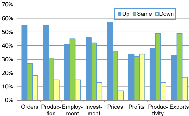
Economic Performance for Minnesota's Manufacturing Industry -- 2018, Compared to 2017

Minnesota manufacturers reported mostly unchanged or improved conditions. Forty-nine percent reported unchanged productivity and exports while 45 percent experienced stable employment. Respondents were closely divided about profits with 34 percent reporting growth, the same percentage experiencing decrease and 32 percent unchanged conditions. The diffusion index for this indicator was 50, lower than the index of 54 for 2017, indicating contraction. Nonetheless, improved conditions were experienced by 55 percent of manufacturers with respect to number of orders and production levels.