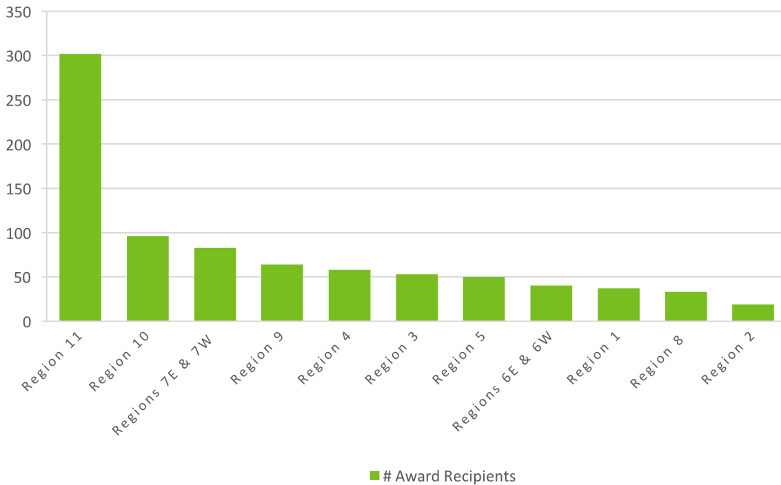
Figure 3. Teacher Shortage Loan Repayment 2017 Award Recipient by Economic Development Regions

NOTE: A list of 238 additional school districts with less than 10 award recipients each is provided in Appendix A.