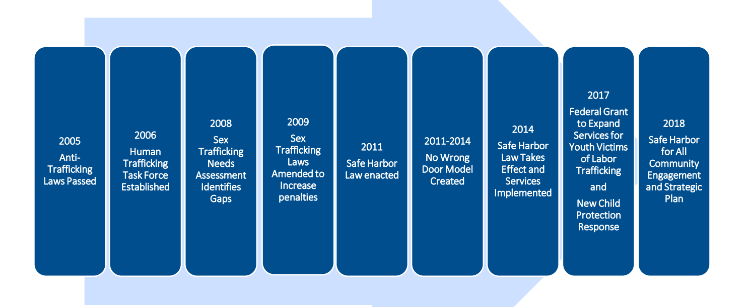
Chart Showing Stages of Safe Harbor History Described in Background Section of Strategic Plan