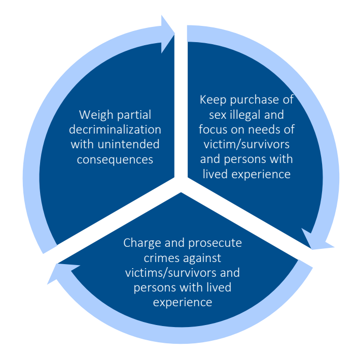
Image Showing Approaches Related to Partial Decriminalization Described in Recommendations

1. Planning Process: Direct stakeholders to engage in an appropriately organized and funded planning process to weigh partial decriminalization of prostitution offenses for the individual being bought or sold and the necessary government and community system supports. A well-considered process will be multi-year and multidisciplinary and must examine the benefits as well as the negative unintended consequences addressed in the report from the research partners. It also must examine how a variety of sectors will play a role and what funding will be needed to build a comprehensive response to exploited and trafficked victim/survivors. Finally, it must acknowledge and value the contributions of persons with lived experience who contributed their perspectives to the report and support their continued engagement in the development of any policy changes addressing partial decriminalization. (See Recommendation 5 of Results from a Strategic Planning Process .)