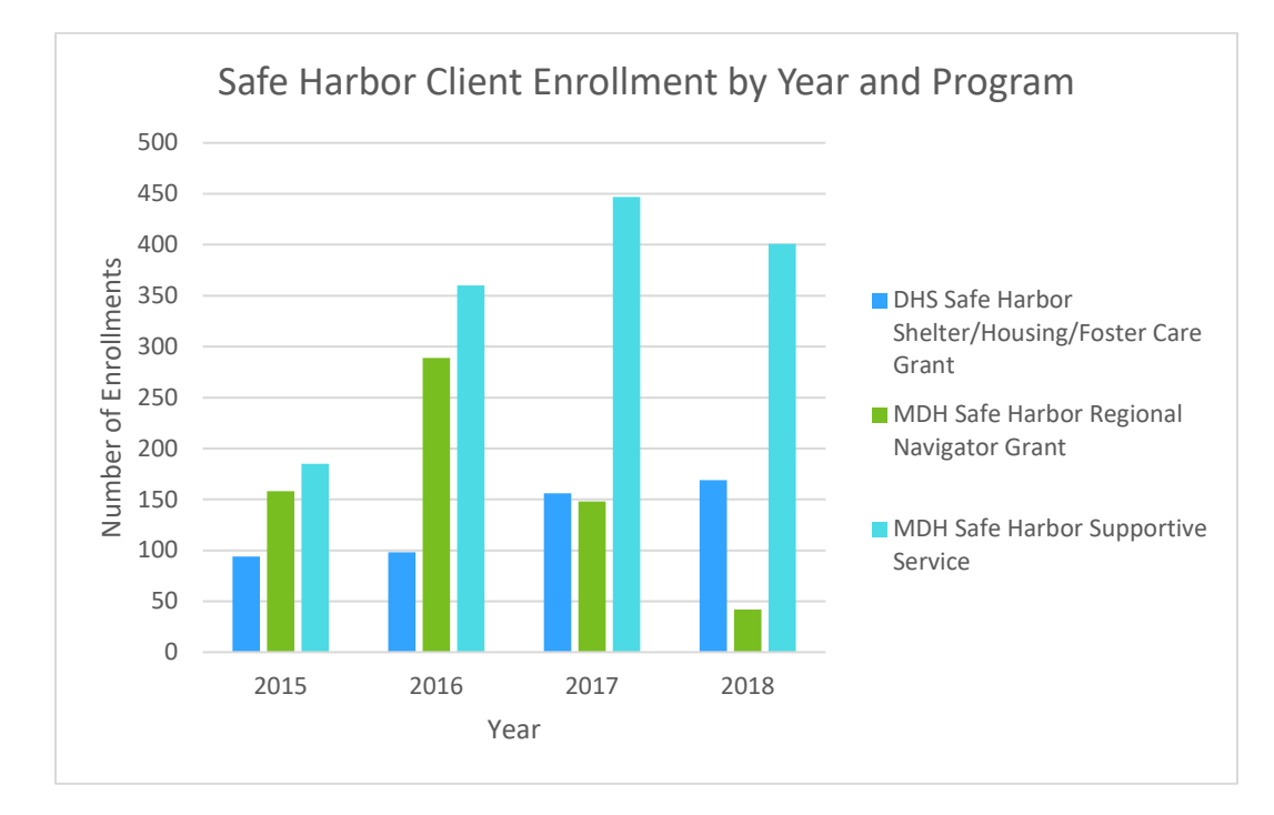
Chart 3: Safe Harbor Client Enrollments by Year and Program*

*Note: In 2017 the role of Regional Navigator was changed to specifically limit their involvement in long-term direct service provision and to direct their focus more on community assessments/resource identification, trainings, case consultations, protocol development, referrals and short-term direct services when no other service provider is available. This change is reflected in the decreased number of enrollments under the MDH Safe Harbor Regional Navigator grant in 2017 and 2018. However, it has increased the number of enrollments with supportive service providers and allowed regional navigators to incorporate more prevention activities in their work.