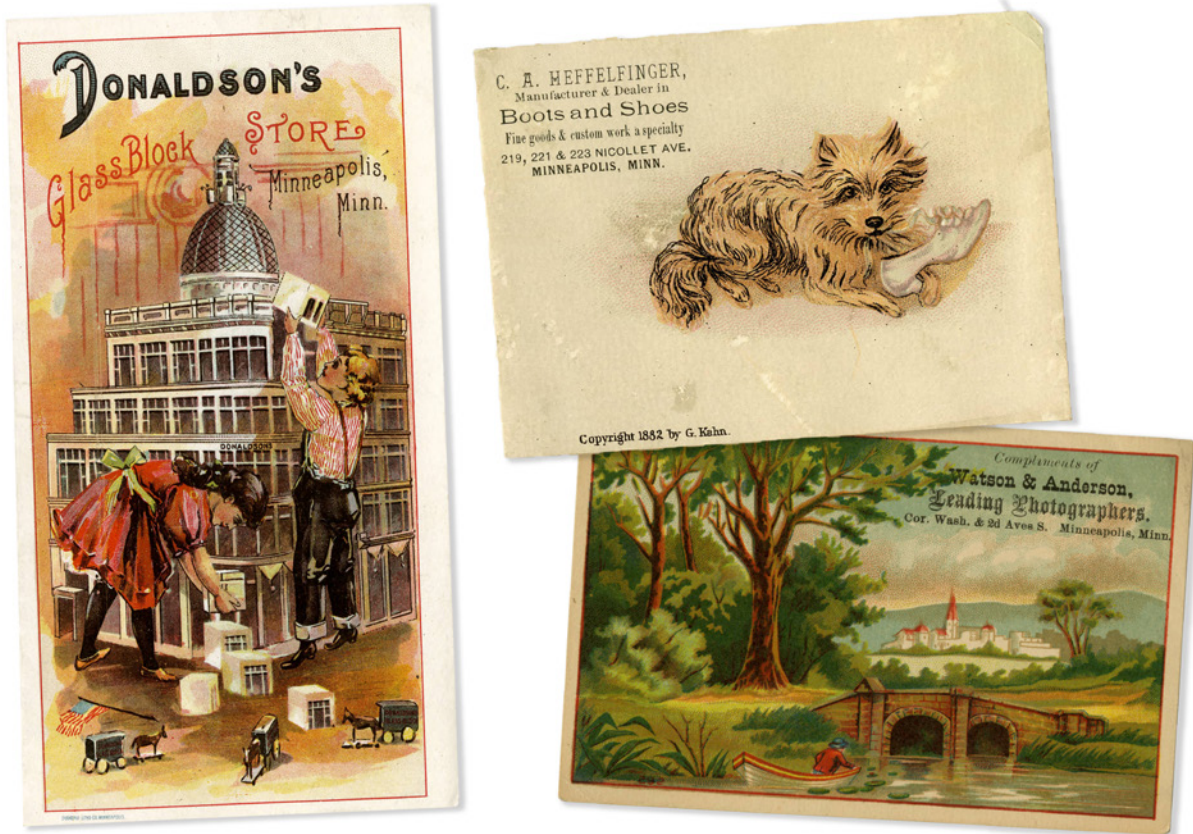
Minneapolis business trade cards ca. 1880-1910, contributed to the Minnesota Digital Library by the Hennepin County Library's James K. Hosmer Special Collections Library.

The Minnesota Digital Library (MDL) is a statewide, multi-institutional collaboration that supports discovery, education, and personal enrichment through digitization of and access to the rich historical resources of the state's public and academic libraries, archives, museums, and historical societies while also preserving these resources for future generations.