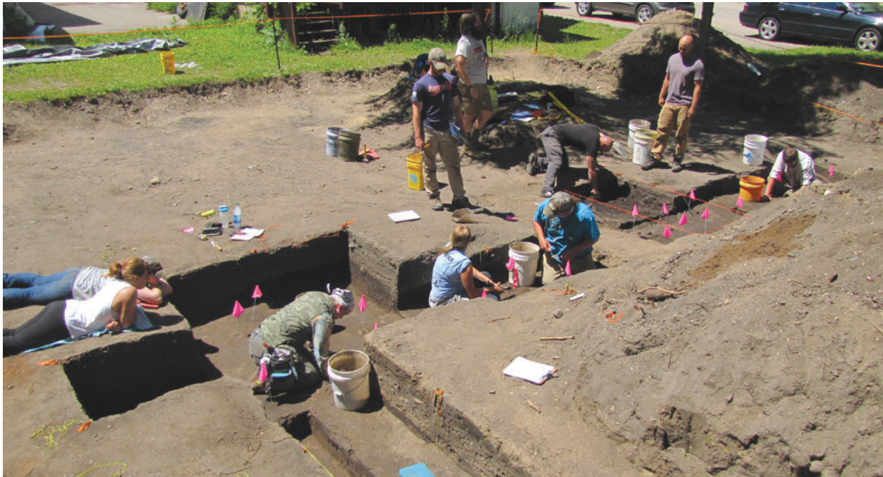
St. Cloud State University faculty and students conduct excavation work at the site of Fort Fair Haven.