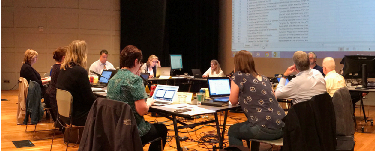
The Historic Resources Advisory Committee (HRAC) meeting at the Minnesota History Center.

The ACHF-funded Minnesota Historical and Cultural Heritage Grants Program provides a valuable opportunity for nonprofit and educational organizations, government units, and tribal organizations across Minnesota to preserve and share the state’s history and cultural heritage.