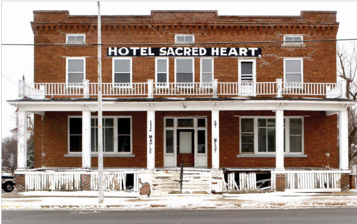
The Hotel Sacred Heart was built in 1914, and the Sacred Heart Area Historical Society is currently working to restore it.