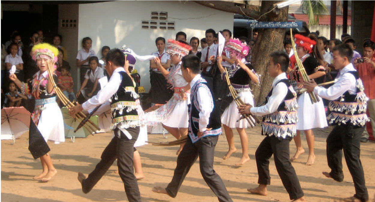
Dancers and Qeej players performing from a Hmong Cultural Center exhibit panel on the Qeej, a traditional instrument.